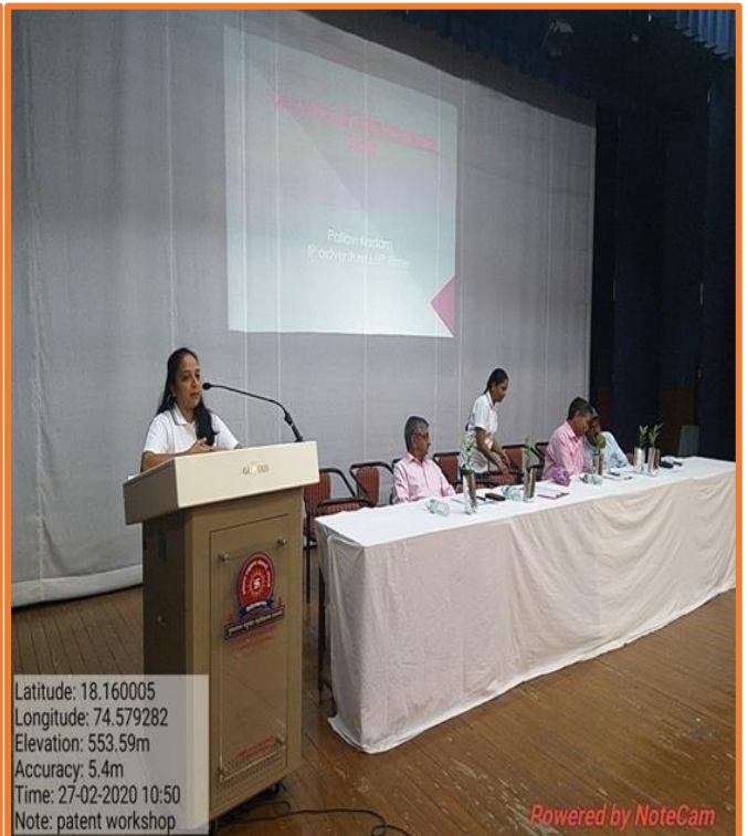
Patent expert delivering talk on patent.