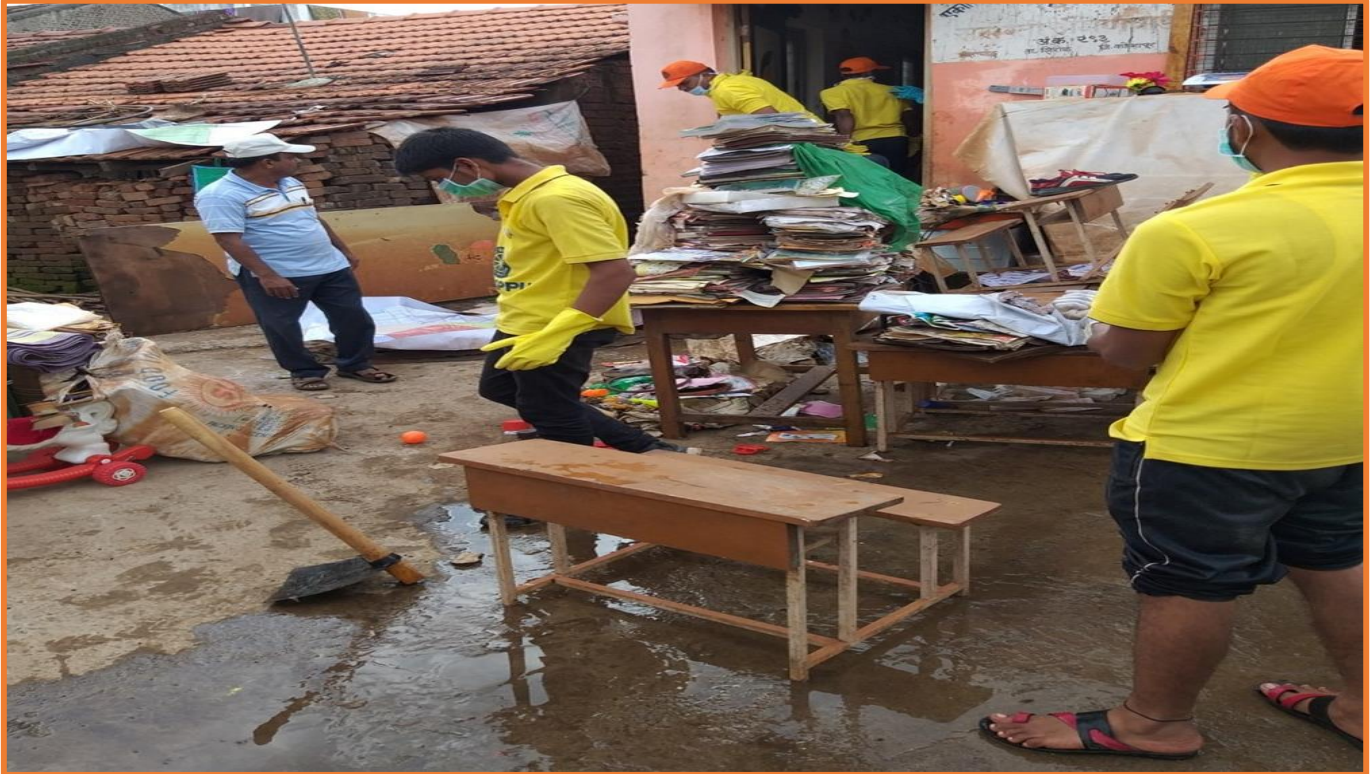
Cleaning of Nursery school material damaged by overflowing situation at Danwad.