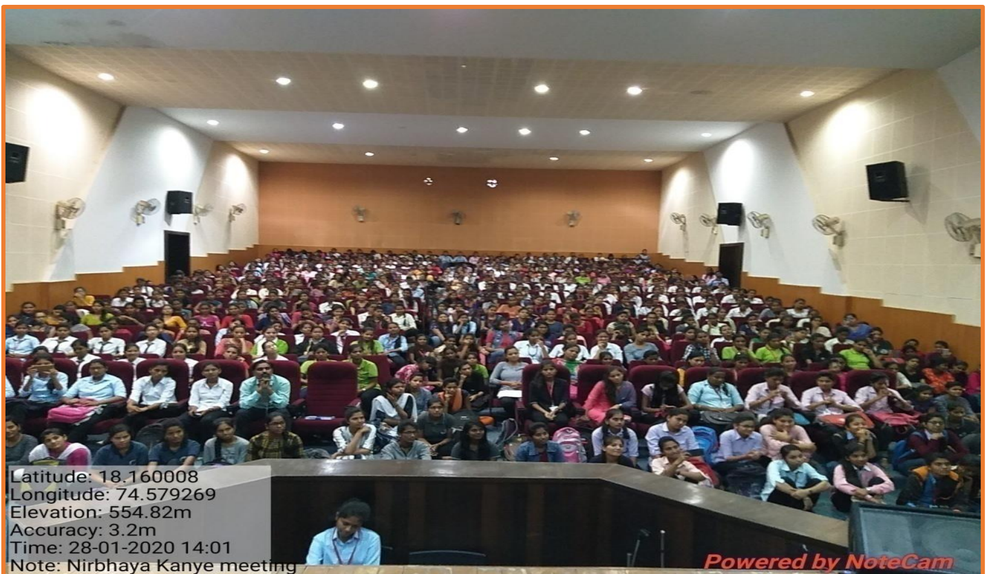
Participants in Nirbhay Kanya Abhiyan.