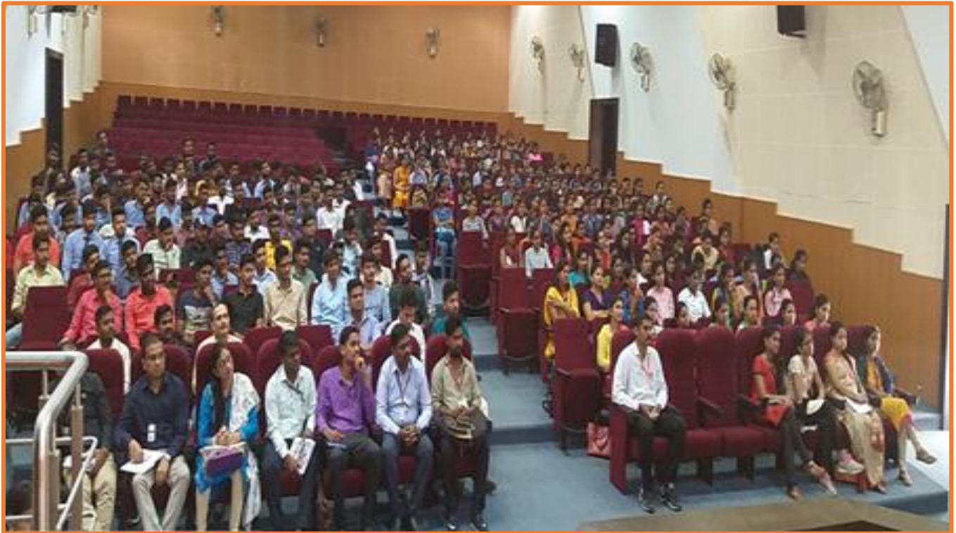
The participants are attentively getting information about filing of patent.