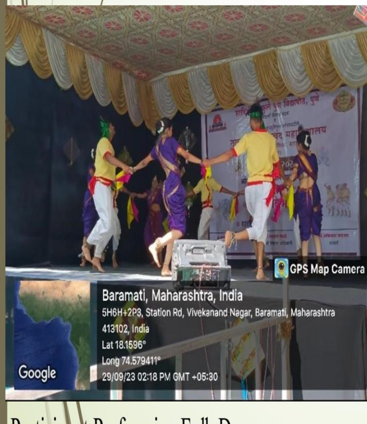
Participant Performing Folk Dance