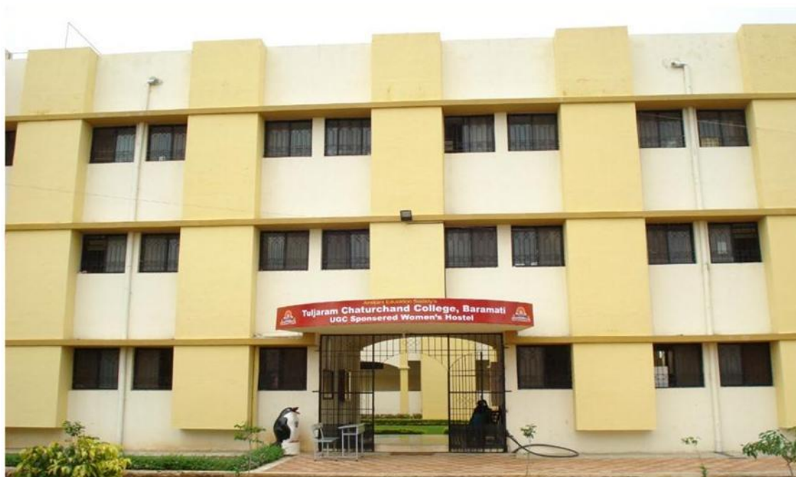
Girls Hostel Wing No. 1

The college has five women's hostels on the campus, four for students and one for working women with capacity of 1000 and 30 respectively. All these hostels are well furnished with the facilities like security, well managed and hygienic mess, RO drinking water, recreational hall with television and newspapers, Gym for physical fitness , health center with first aid kit. For safety and security of hostellers the 24 hr security is provided by the college. Additionally, biometric system is installed at entry and exit gate of each hostel wing. Spacious open space and parking facility is available at all girl's' hostels.