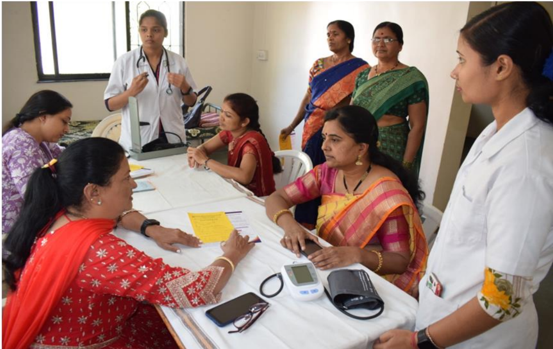
Free medical check-up for girls and women on the campus