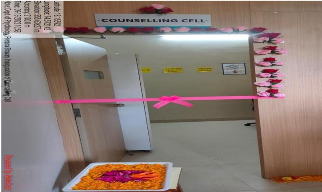
Counseling Cell for Mental Health