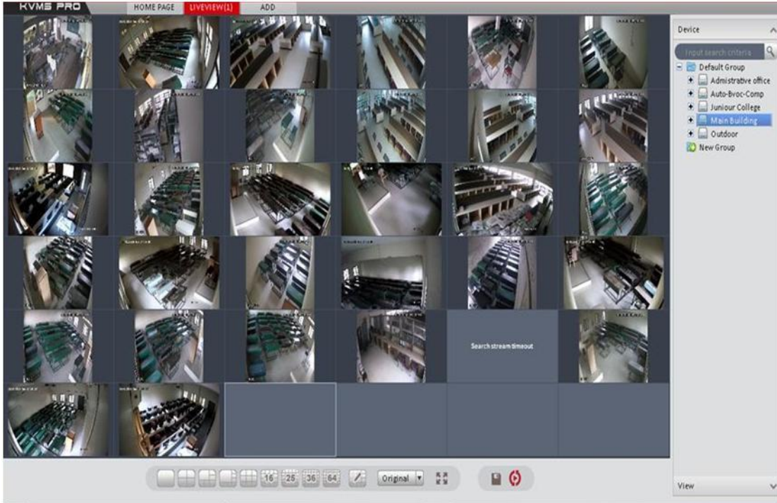
Centralized CCTV Surveillance Monitoring