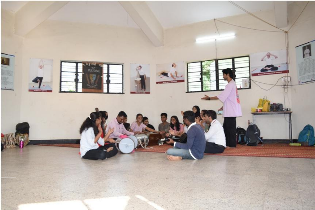
Students preparing for cultural performance