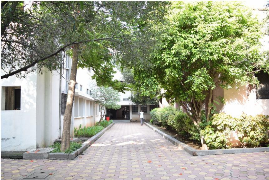
Hostel Wing 5