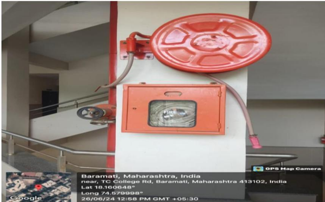
Fire Safety System