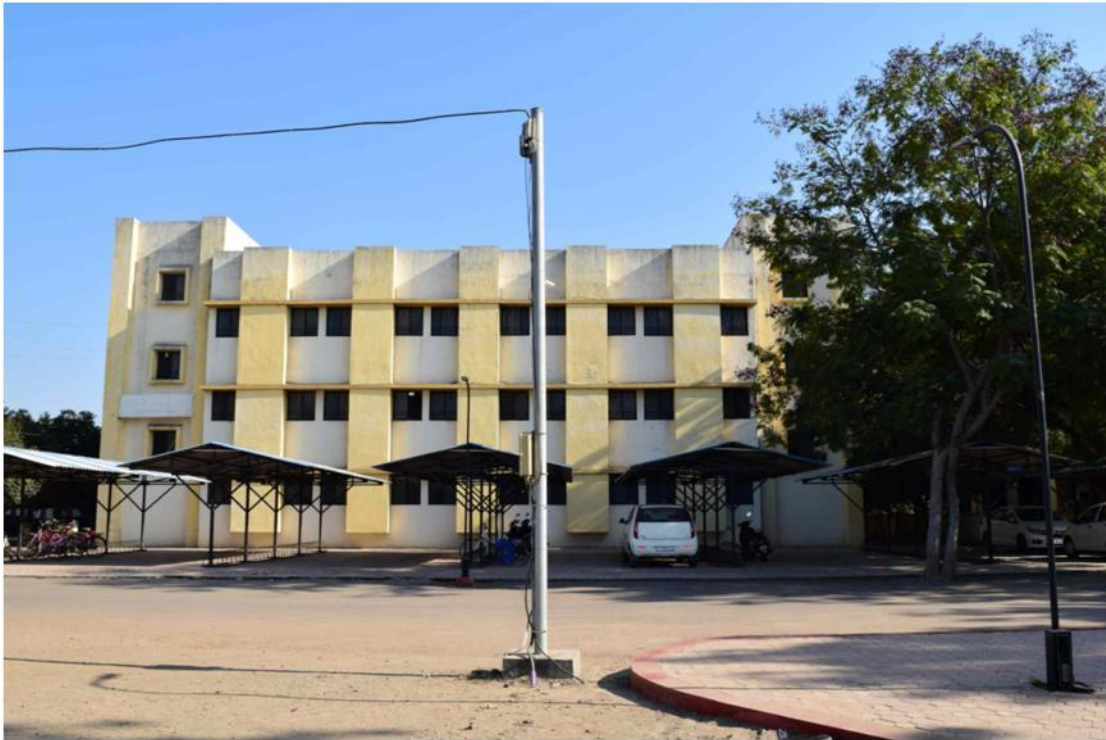
Hostel Wing 3