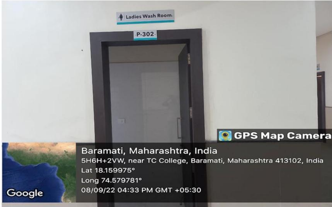
Washrooms for women at every floor