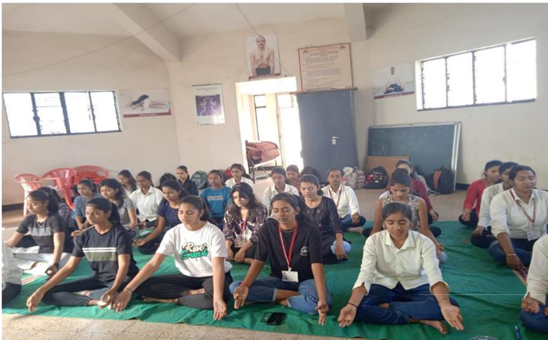
Guided meditation at Yoga Hall