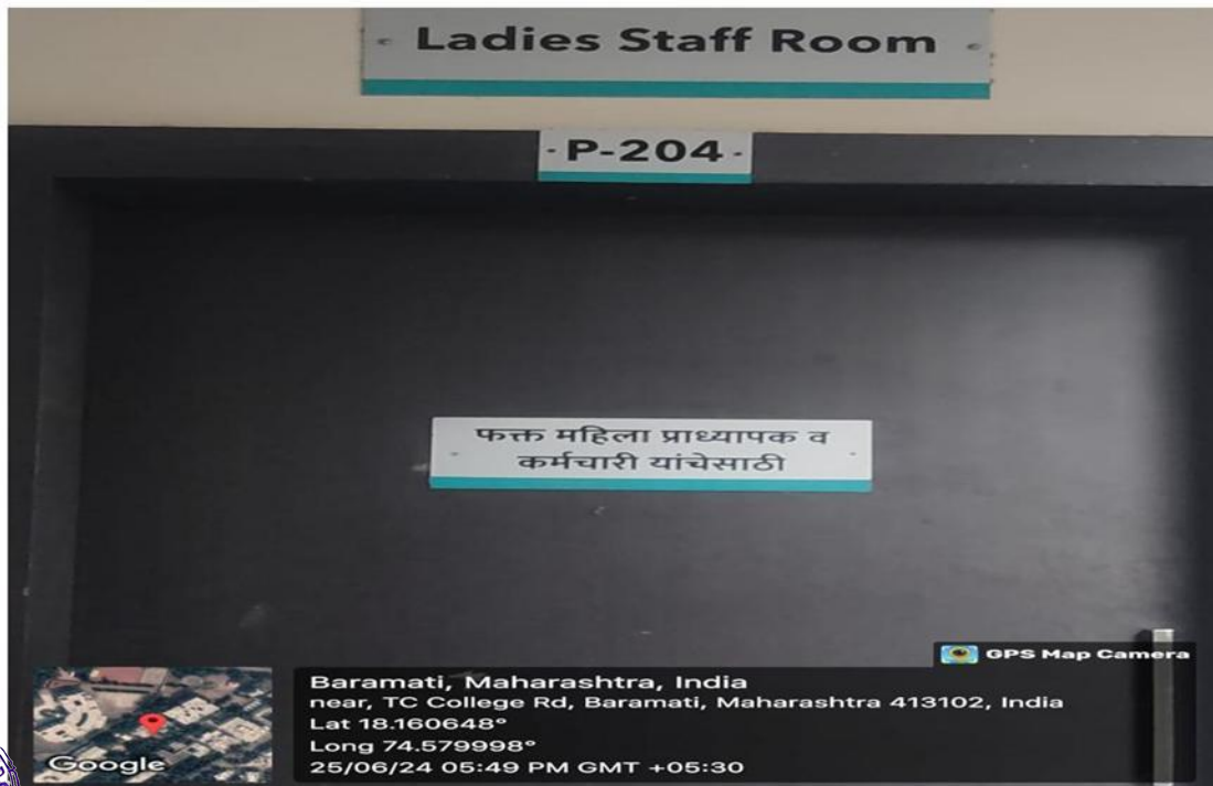
Rest Room for Women staff