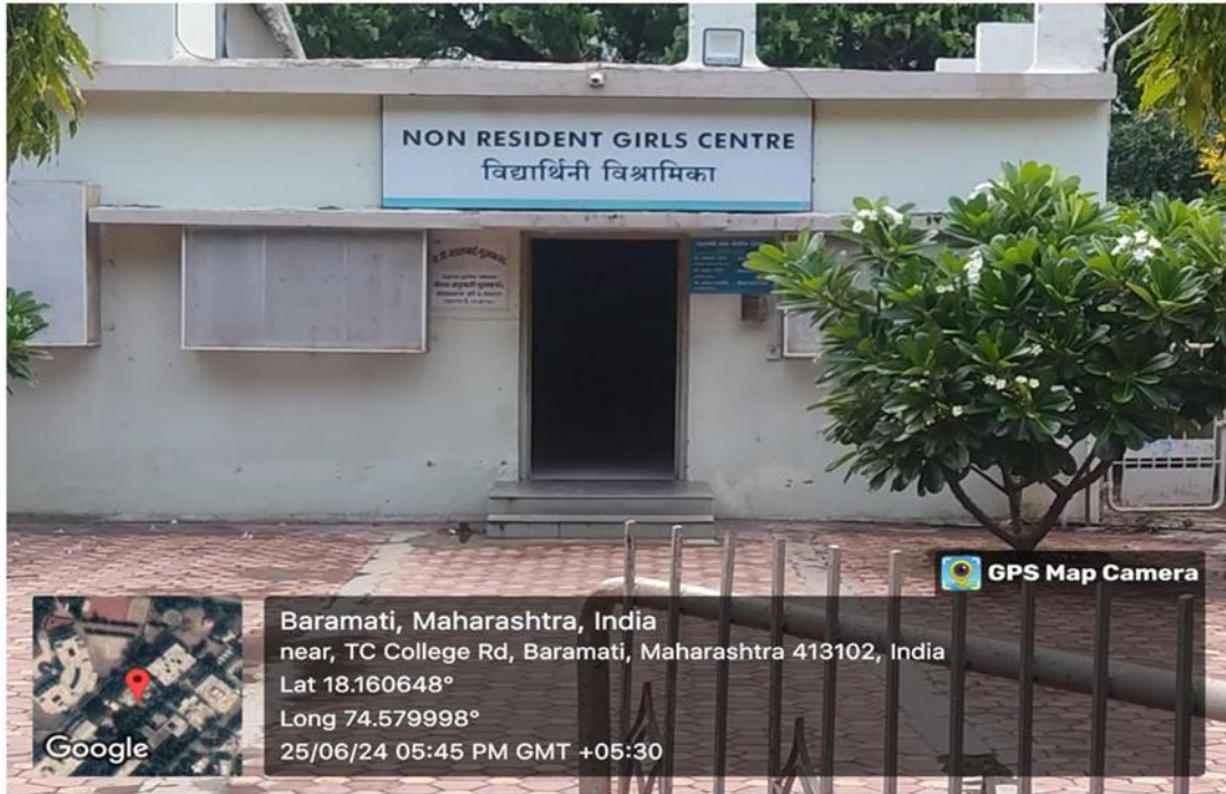
Rest Room for girl students