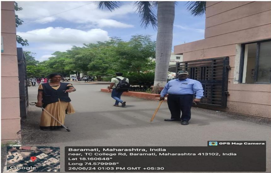
Male and Female Security Guard at Main Entry Gate