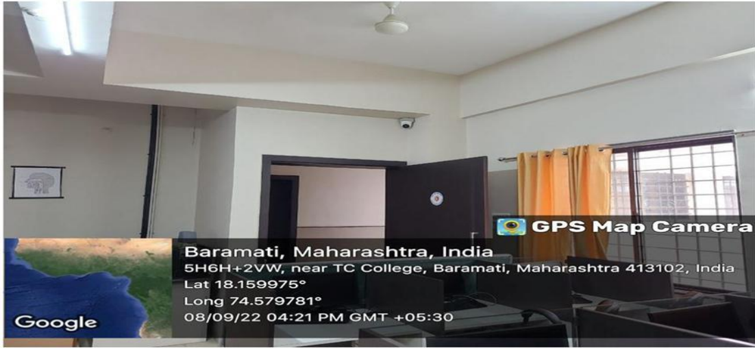
CCTV equipped classrooms