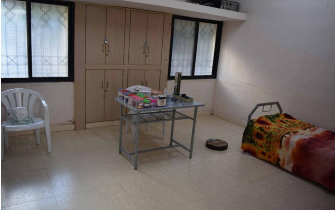
Health Center with Primary Medical Aid