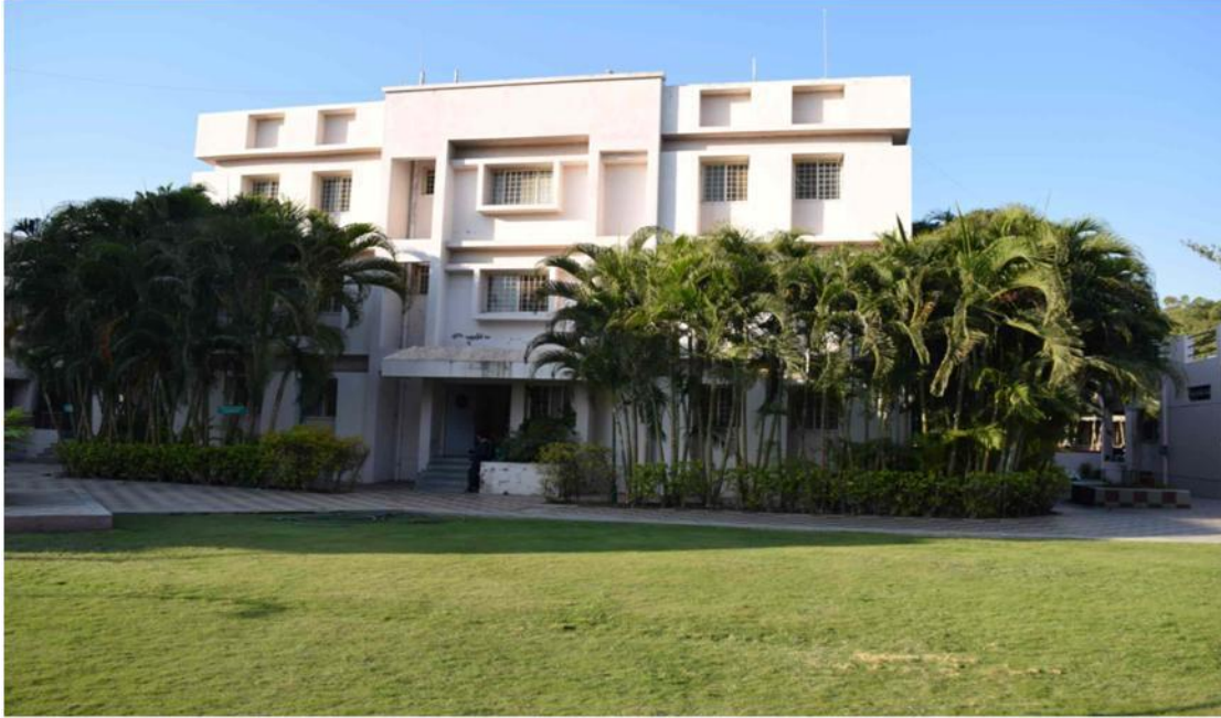
Hostel Wing 2