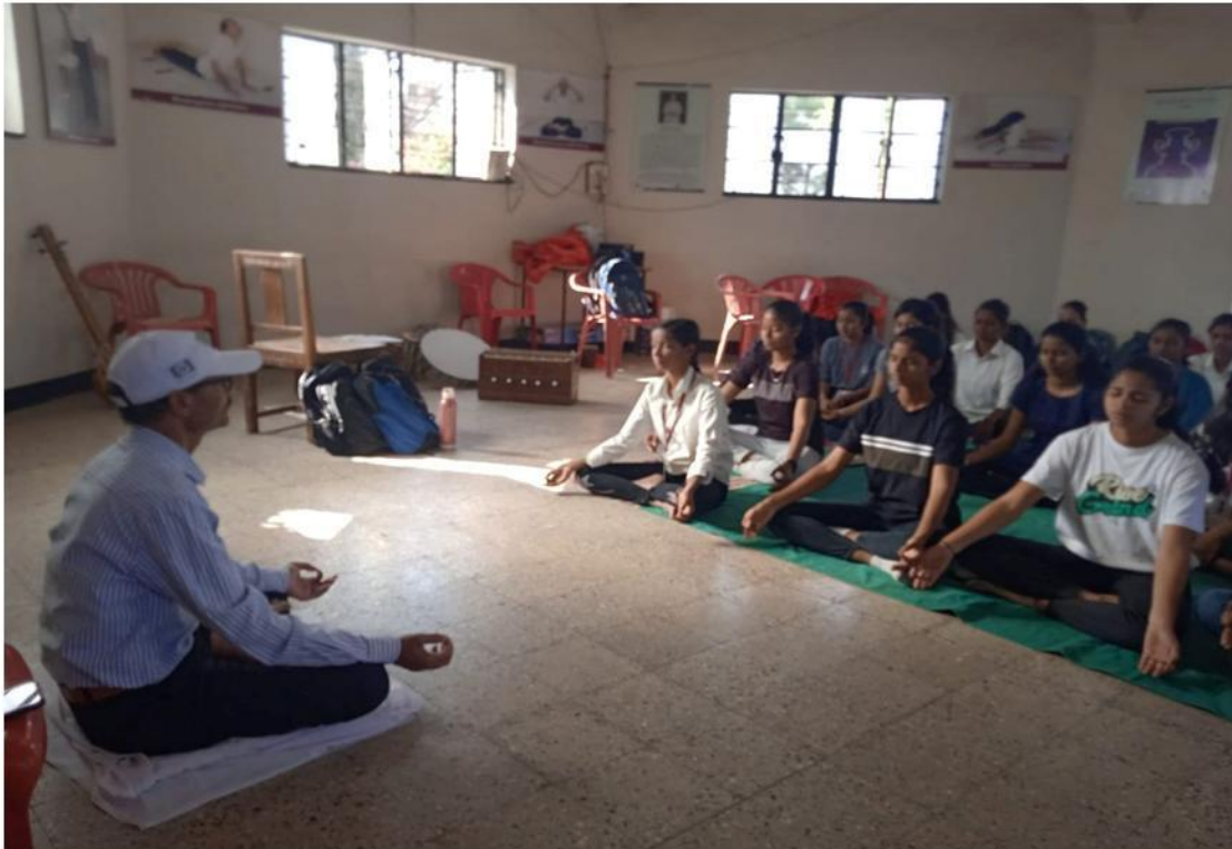
Yoga Hall for Meditation and Health