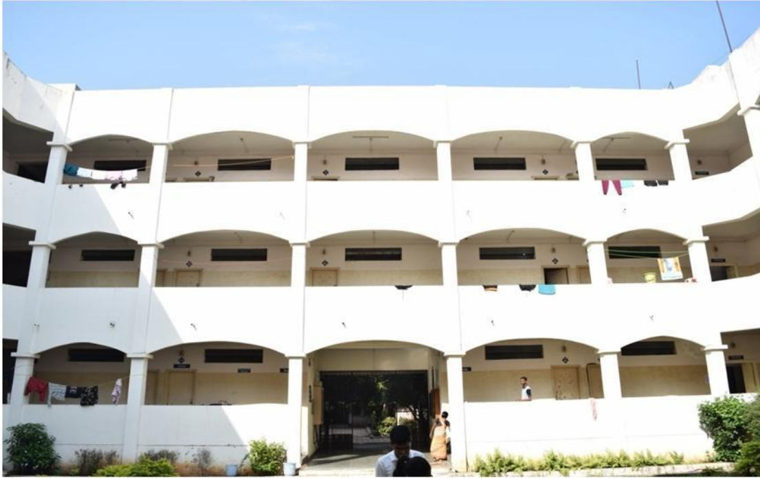
Hostel Wing 4