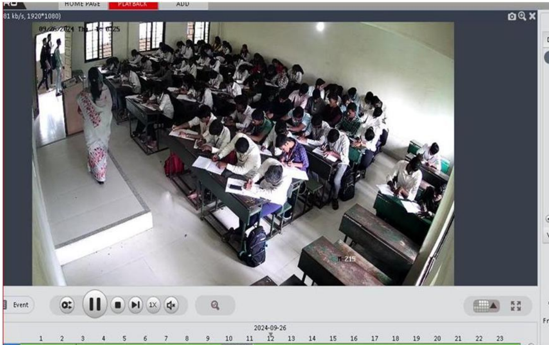
CCTV Surveillance monitor