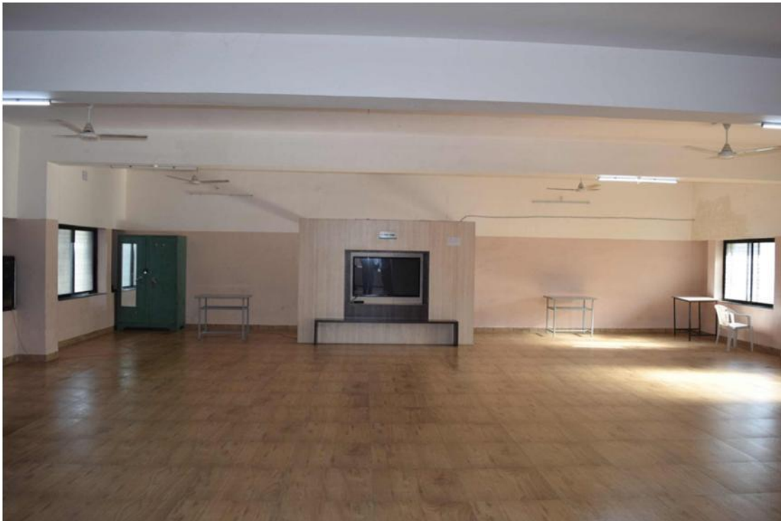
Recreational Hall at Girl's Hostel