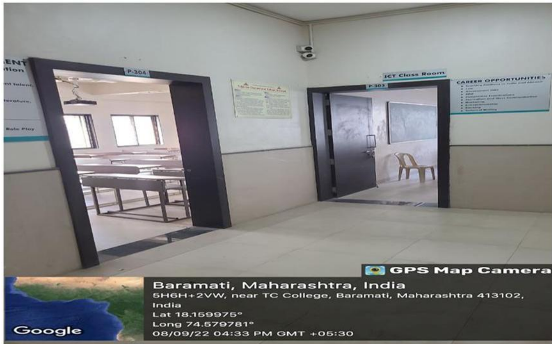
CCTV at outside classroom