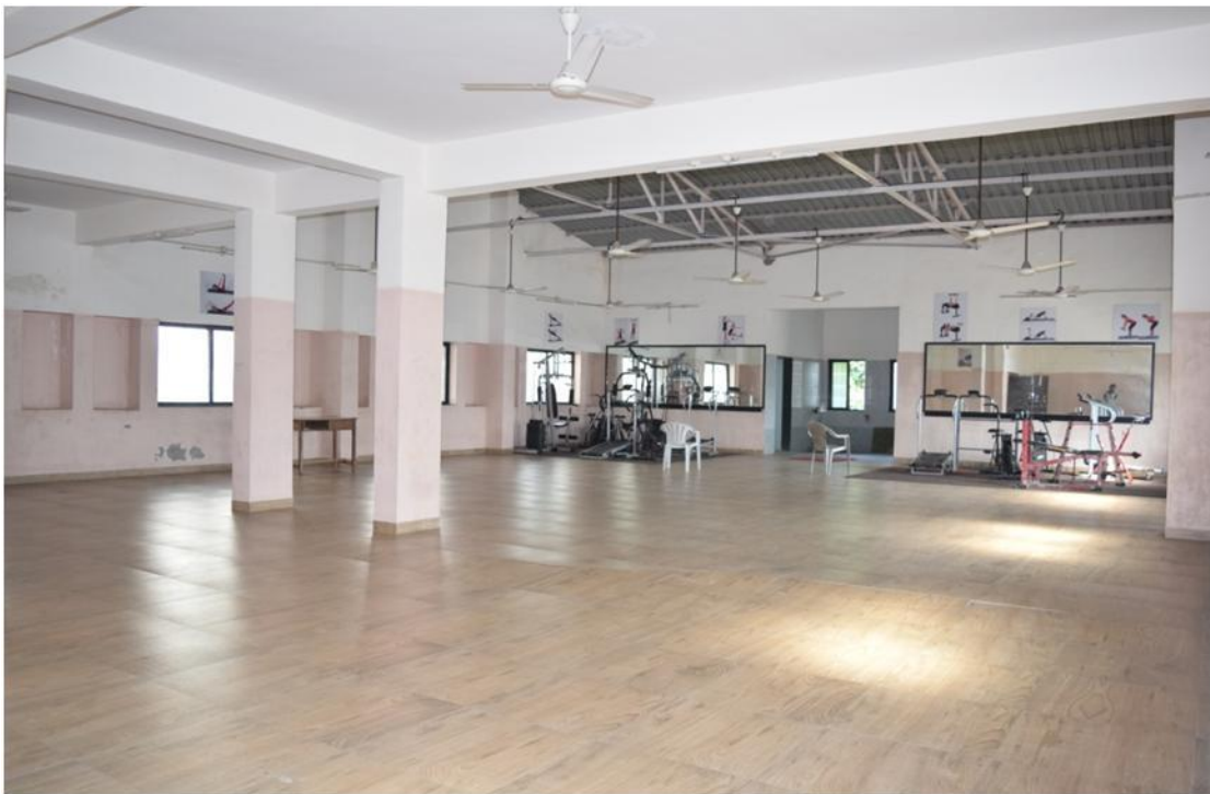
Gym at Girls' Hostel