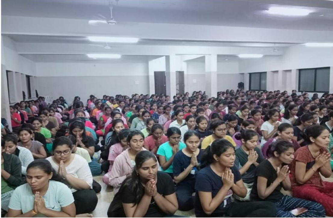
Evening Prayer at Recreational Hall