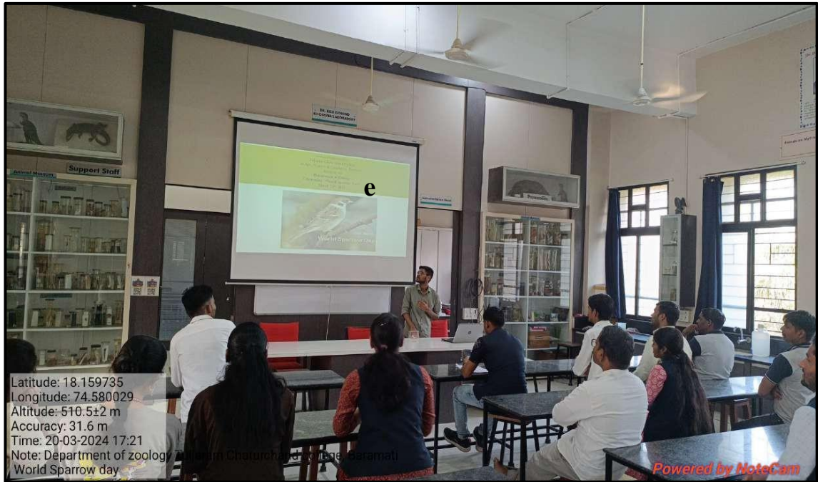
Experts giving information on importance of sparrow