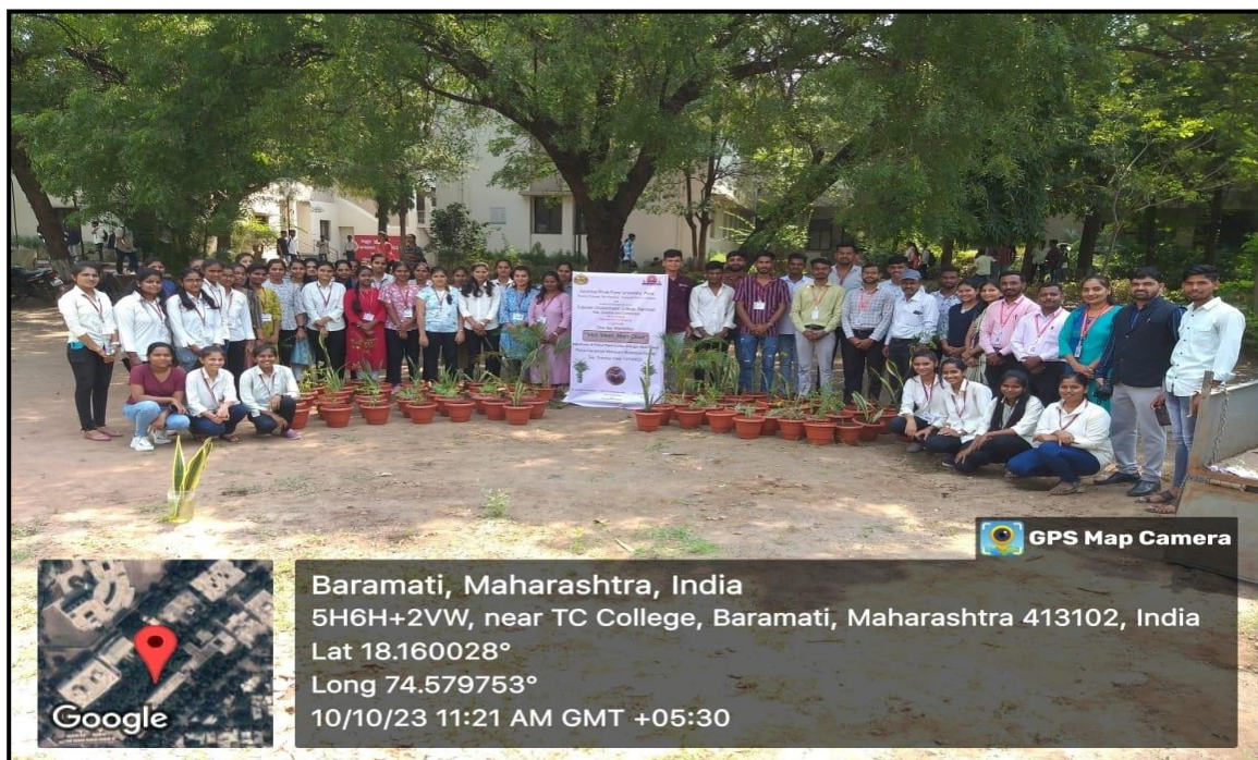
Group photo of the participants