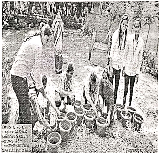
Students from UG and PG actively participated