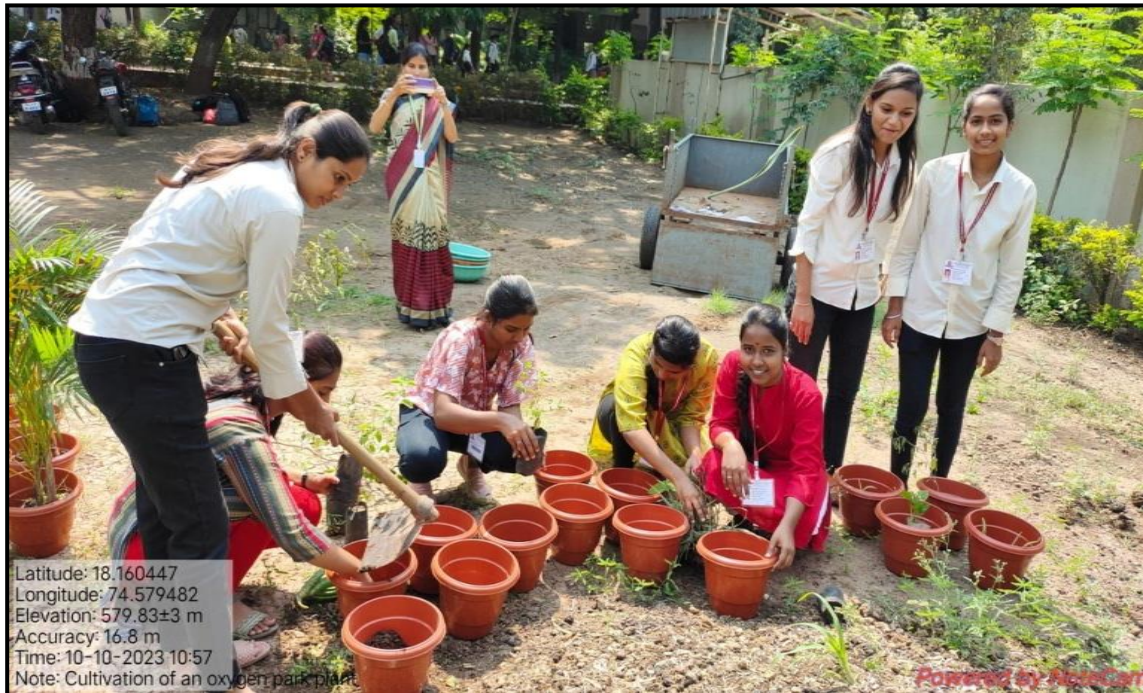
Students from UG and PG actively participated in Oxygen Park Plant workshop