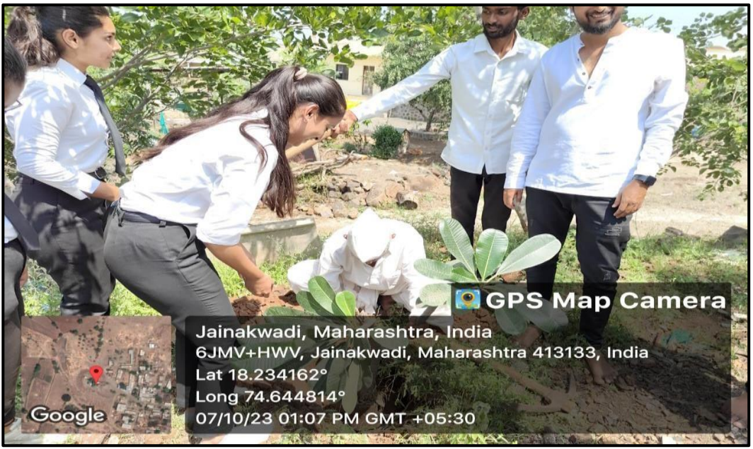
Tree plantation activity at Jainakwadi, Grampanchyat