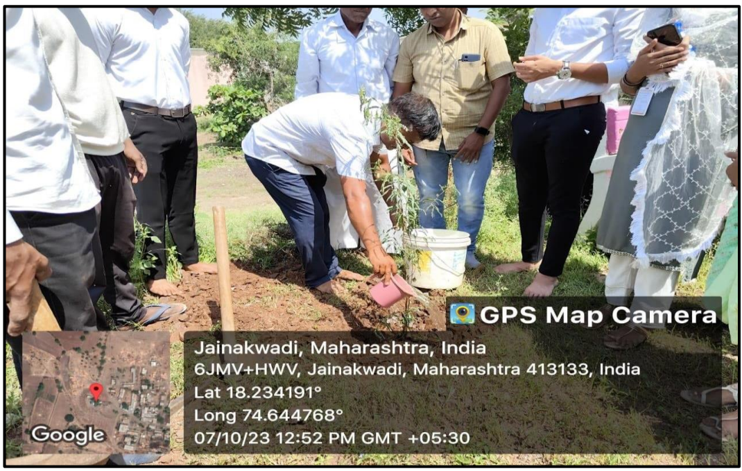
BBA teachers and students in Tree Plantation Drive