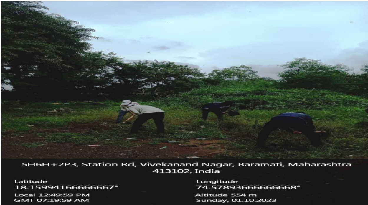
NSS Volunteers cleaning the campus