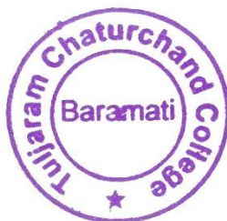
Principal Principal Tuljaram Chaturchand College Baramati

Coordinator Internal Quality Assurance Cell Tuljaram Chaturchand College of Arts, Science and Commerce, Baramati (Pune)-413102