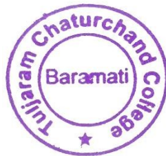
Principal Prindpal Tuljaram Chaturchand College Baramati