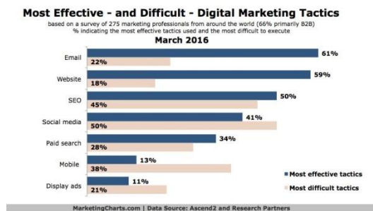
Fig. Most Effective and Difficult Marketing Trends

It goes without saying that every advertiser should use Web Analytics to understand his business and improve the ROI and conversions.