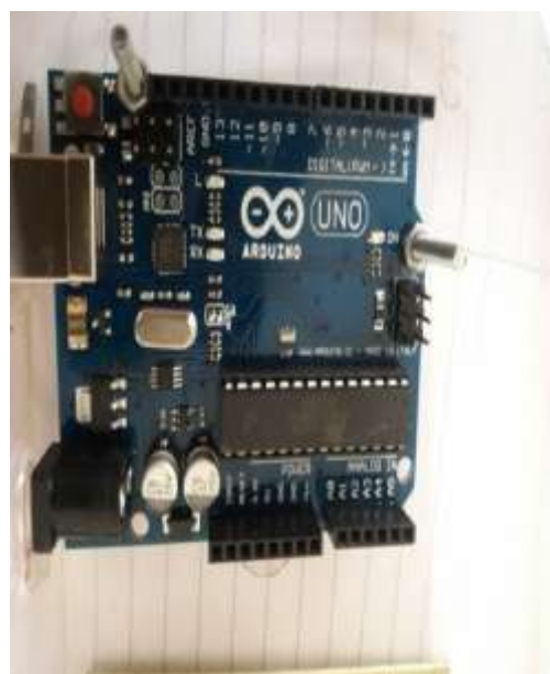
Fig1. Arduino Uno controller

also provide the features for switch which manually controlled device using internet accessibility. So when user not close to device then user also controls the device. For operating device here used Relay module.