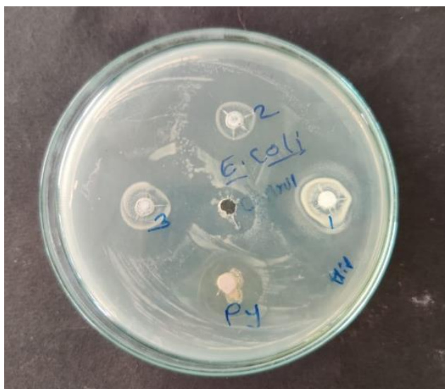
Fig. 3: Antibacterial activity was performed against gram negative bacteria (E coli)