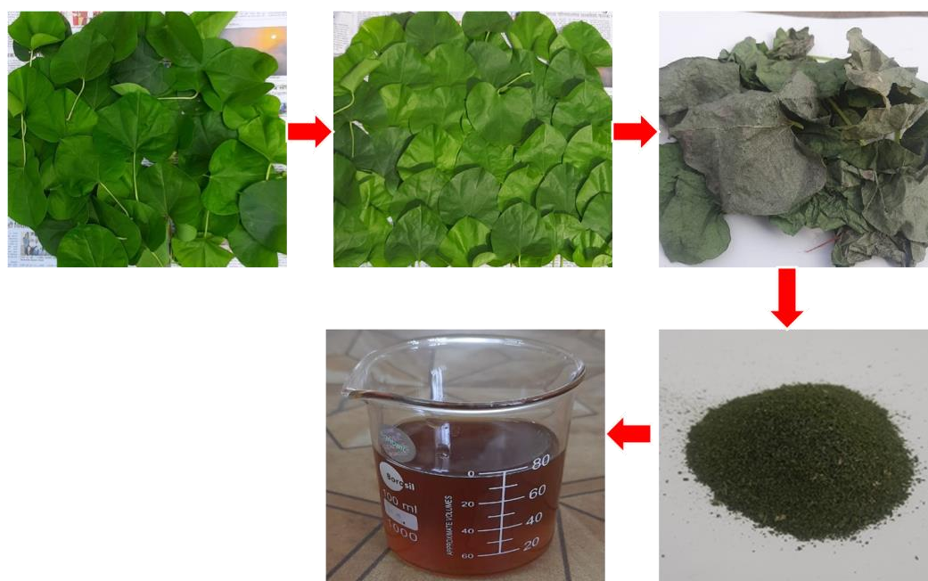
Fig. 1: Extract preparation

A bacterial strain of interest is grown in pure culture. Using a sterile swab, a suspension of the pure culture is spread evenly over the face of a sterile agar plate. The antimicrobial agent is applied to the center of the agar plate. A hole can be bored in the center of an agar for a liquid substance. The agar plate is incubated for 18-24 hours (or longer if necessary), at a temperature suitable for the test microorganism.