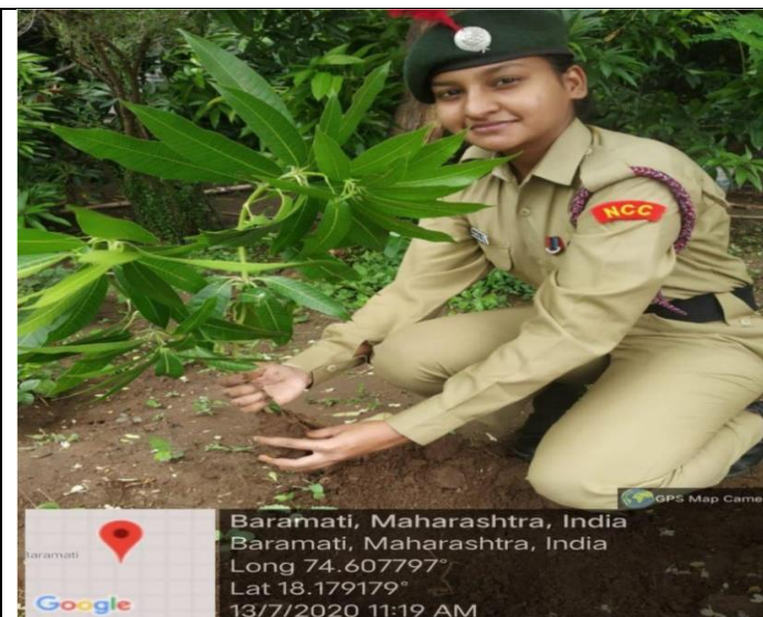
Tree Plantation by NCC candidate Date: 13/07/2020