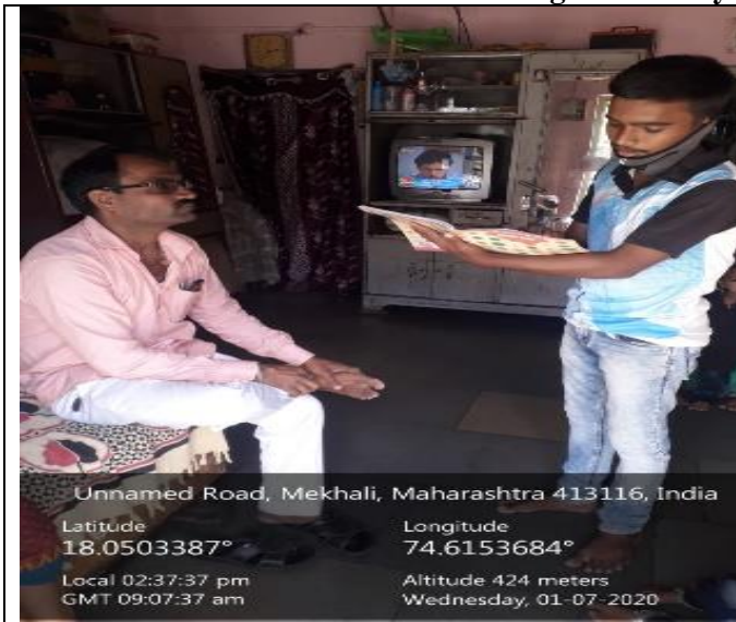
Family Survey done by NSS Volunteers Date:01-07-2020