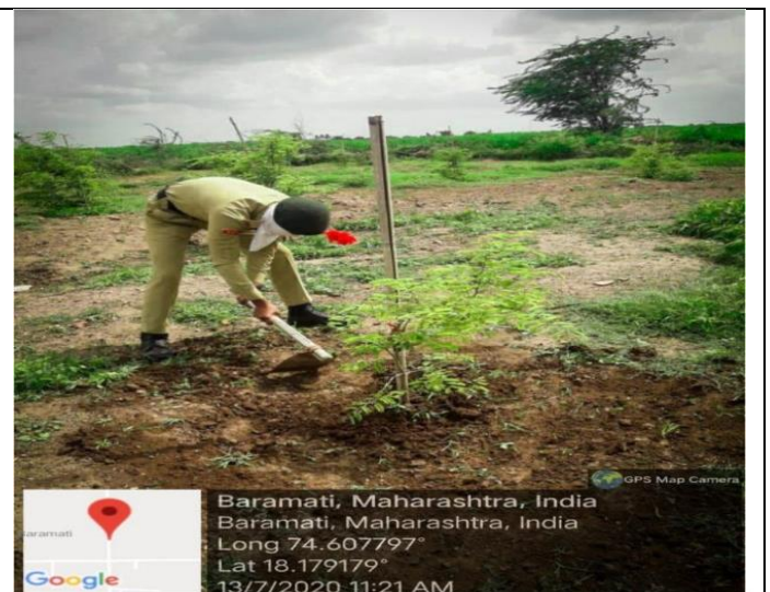
Tree Plantation by NCC Candidate Date: 13-07-2020