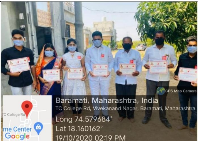
Blood Donated by NSS Volunteers Date:19-10-2020