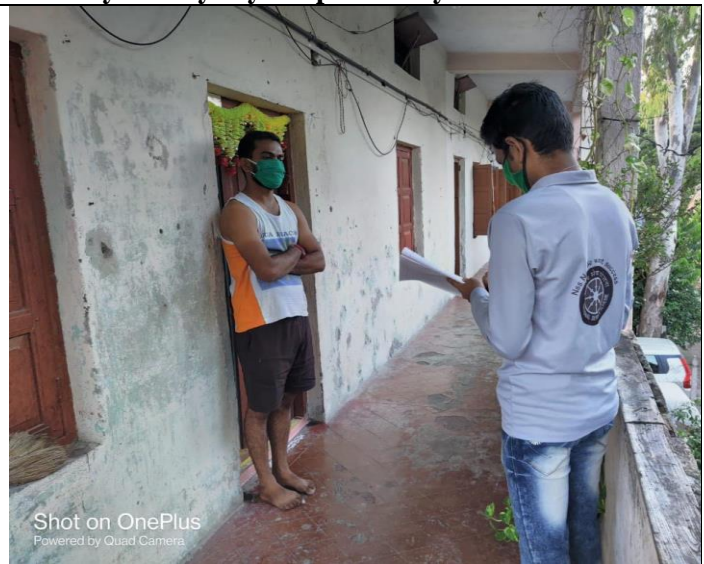
Family Survey done by NSS Volunteers Date:01-07-2020