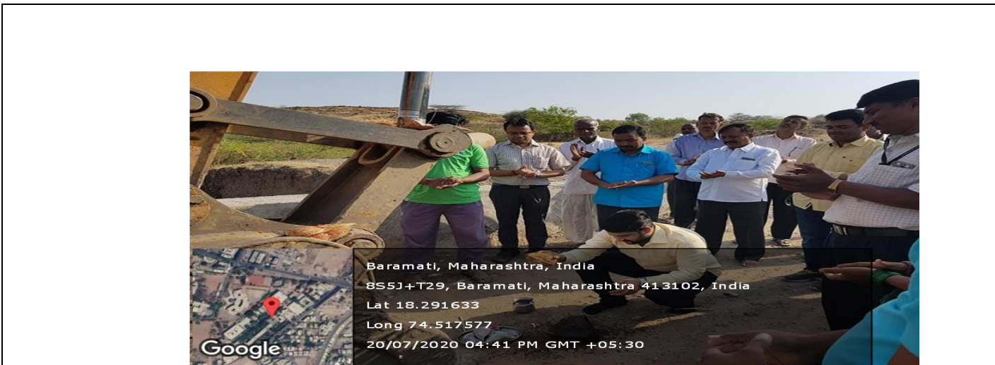
Working for Drought free Maharashtra. Date:19-10-2020