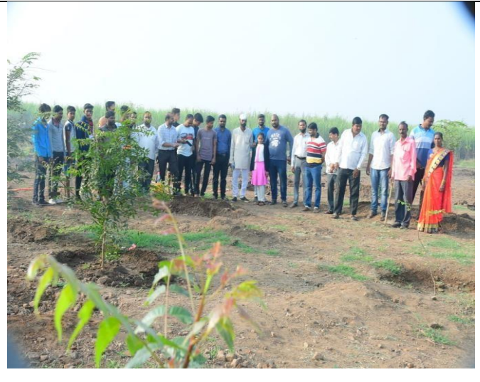
Tree Plantation by Economics department at Adopted Village Aasu-Pawarwadi, Baramati. Date: 17-01-2021