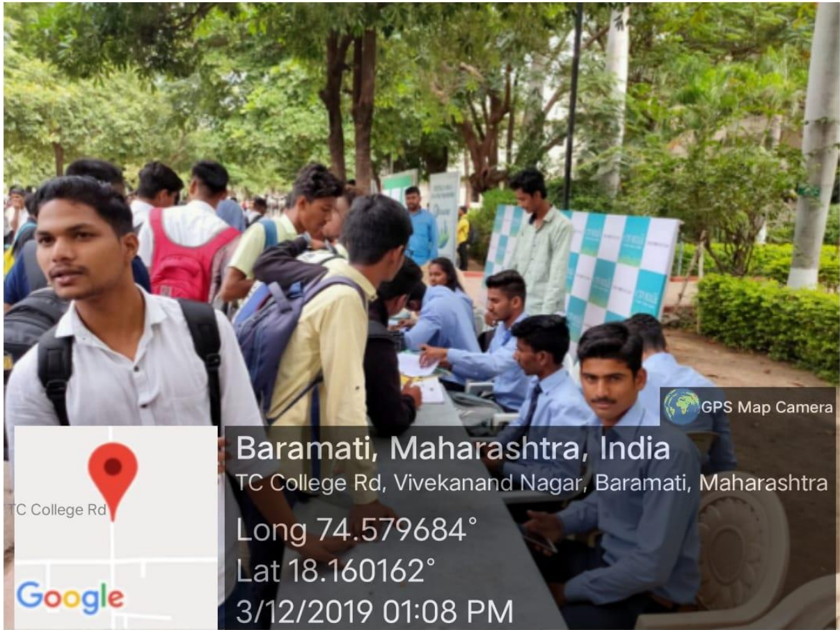
Visited Students for activity