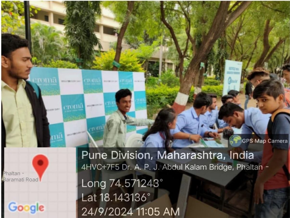
Students Involved in activity