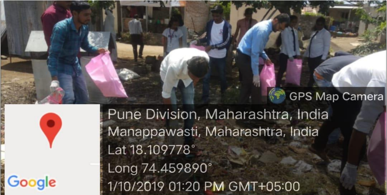
Plastic collection at Manappavasti