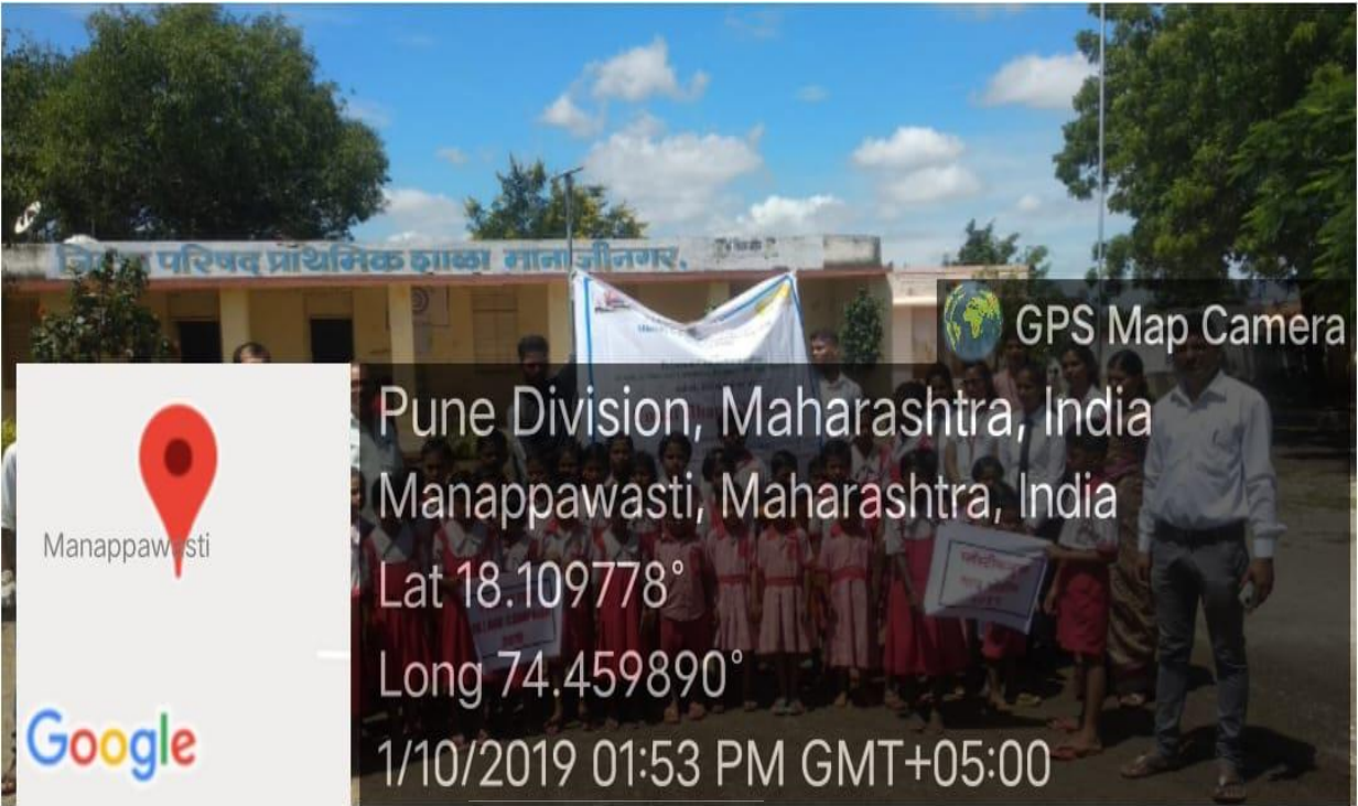
No Plastic Use Rally with Primary School at Manappavasti, Baramati.