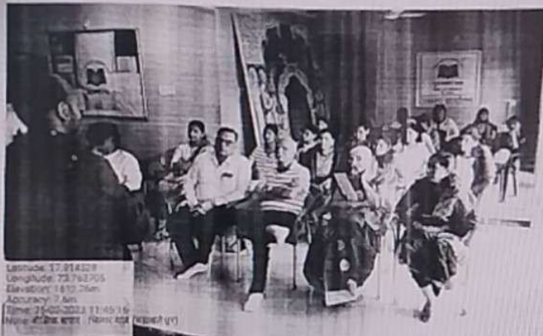
Giving information about Minar village, our