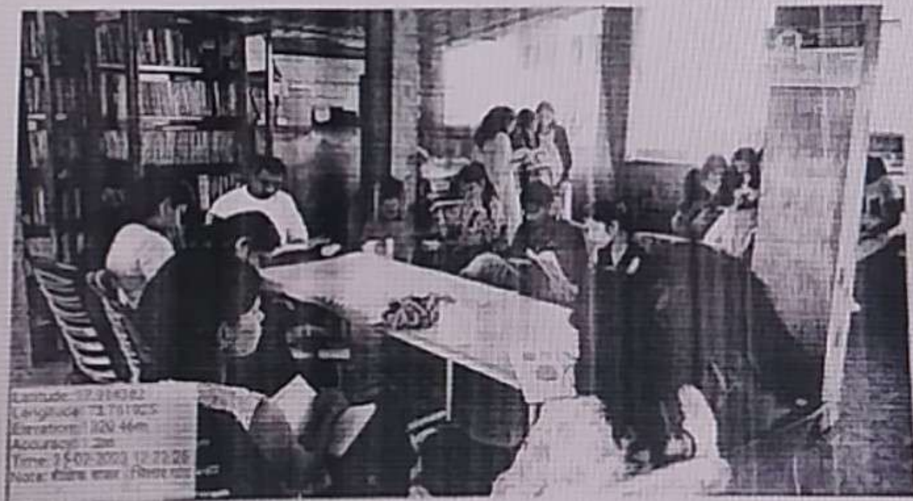
Teacher and students enjoying reading books