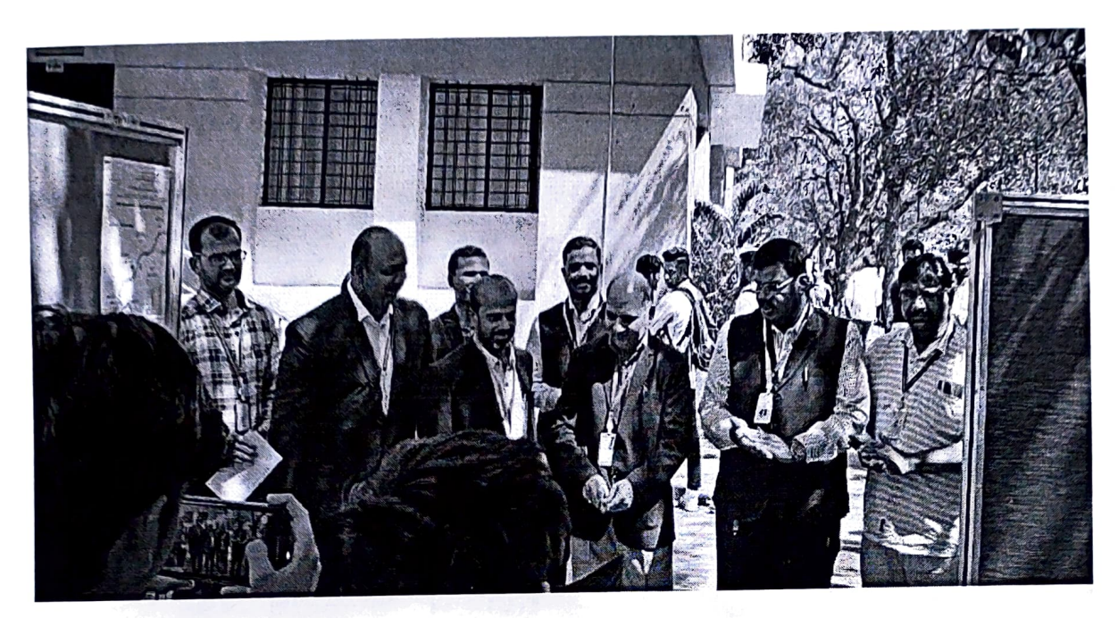
Inauguration of the Event