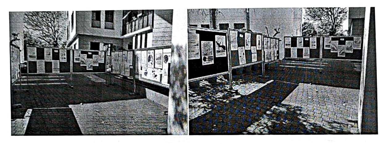
Display of Exhibition