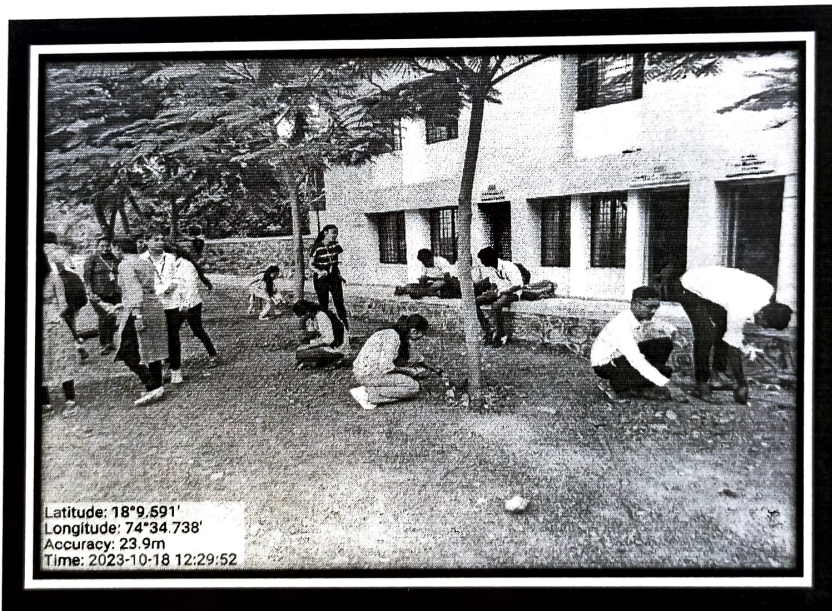
Students actively engaged in cleaning different sections of the campus