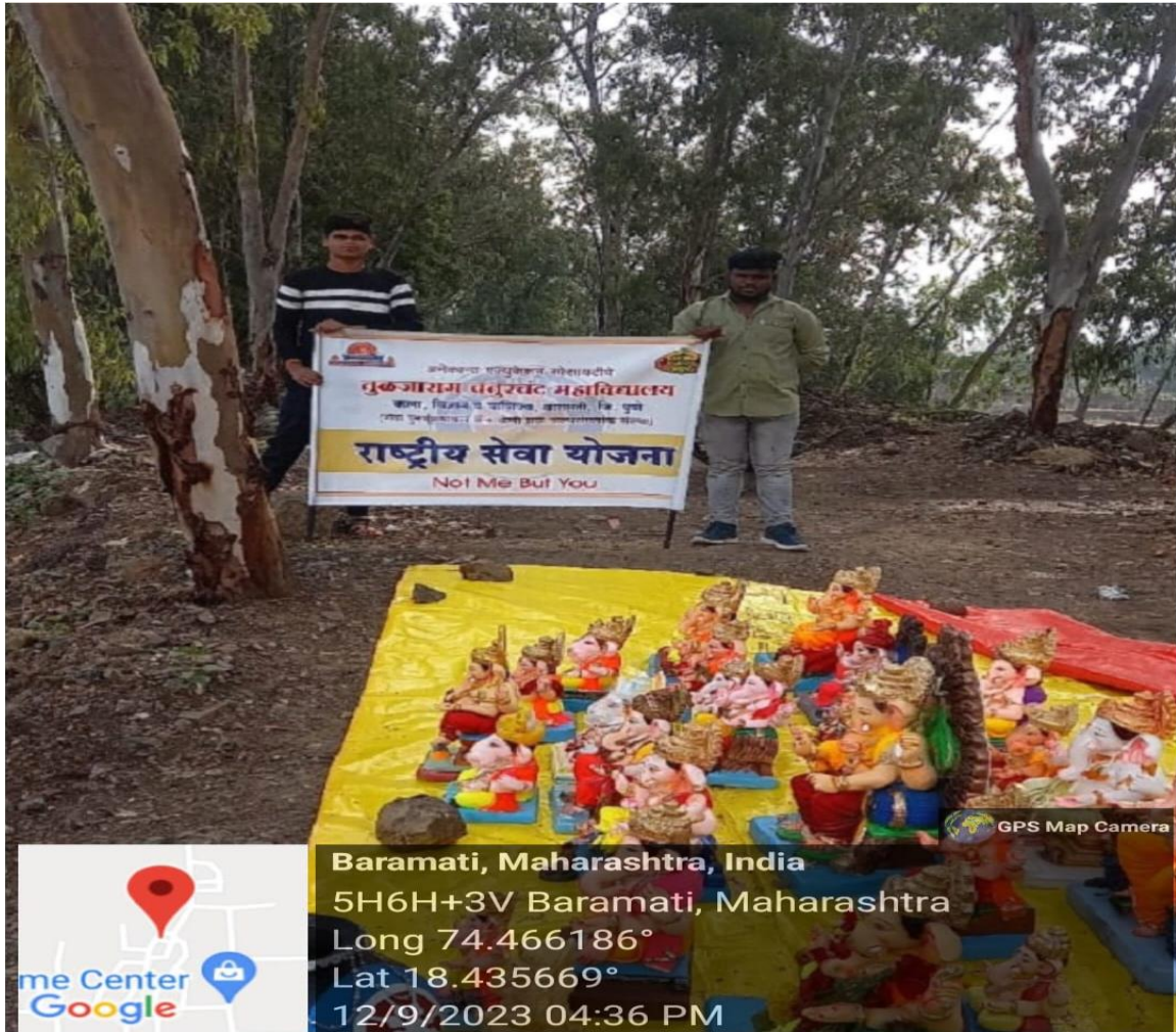
Collection of Ganesh Idols for Visarjan in Tanks