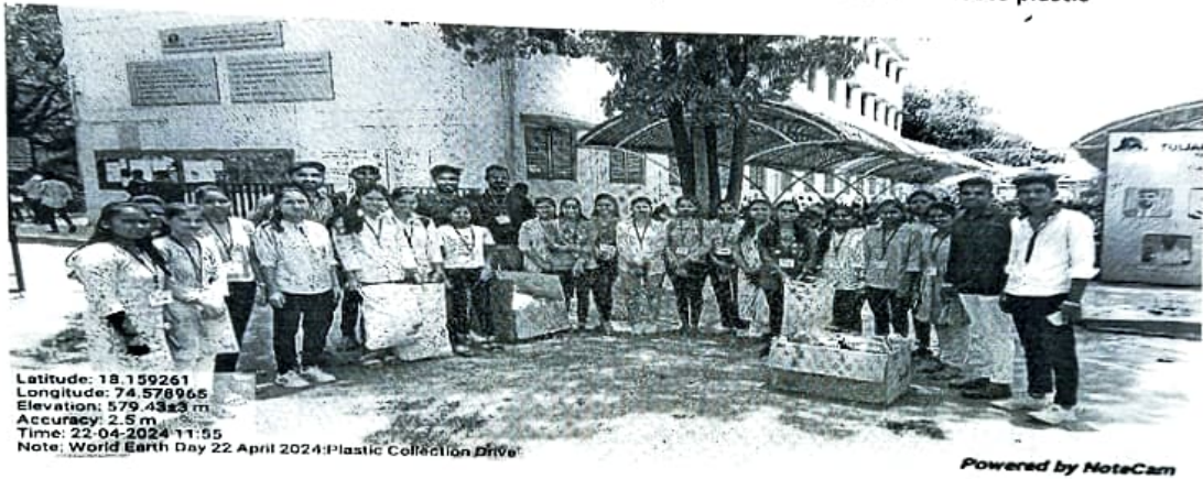
Students and Staff members of Botany Department with Collected waste plastic