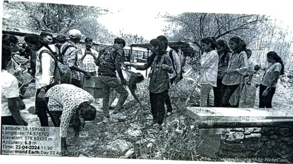
Collection of Plastic Waste in College campus area by our Students of Department of Botany