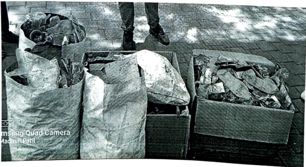
Collected Plastic Waste