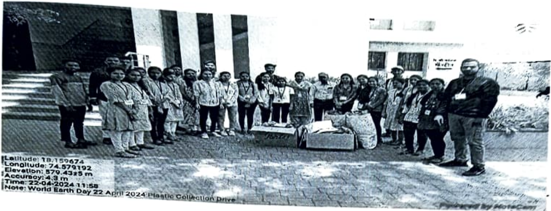
Students and Staff members of Botany Department with Collected waste plastic