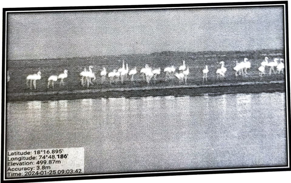
Flamingo Birds at Bhigwan