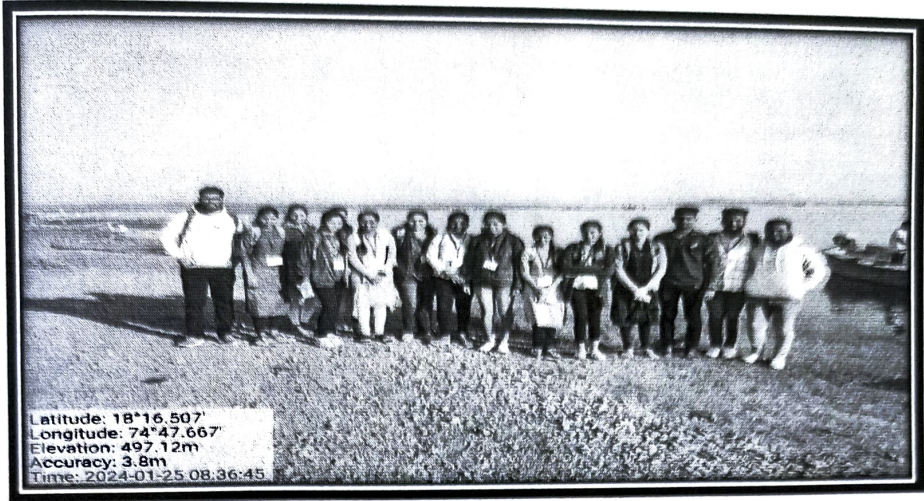
Group Photo with Students at Bhigwan.