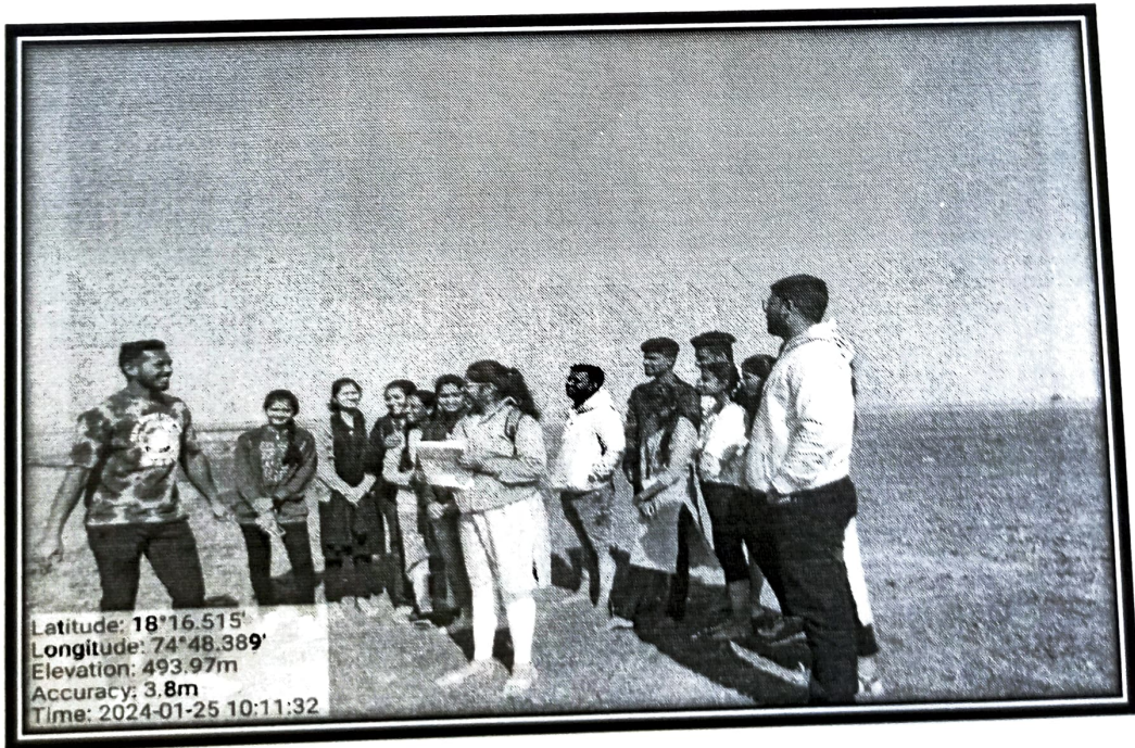
Students are Gathering Information from the Guide about Flamingo Birds.