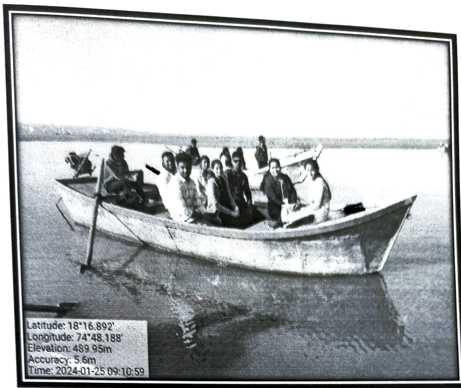
Students are Watching Flamingo Birds