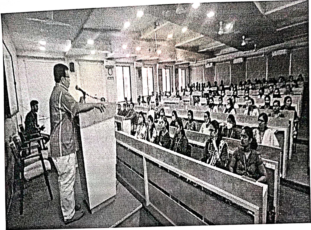
Guests discuss about food safety with students