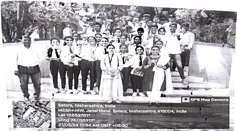
Exploring Industry Insights: Students and Faculty Pose for a Group Photo outside Venugopal Food Products (Parle G), Satara.