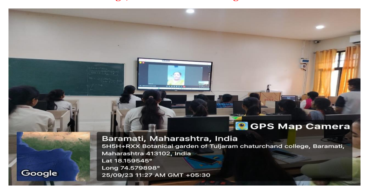
Question Answer Session during Lecture