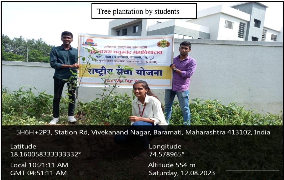
Tree plantation drive run by NSS