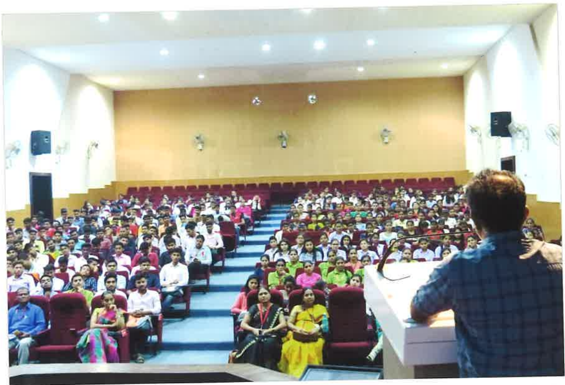
कार्यशाळेकरिता उपास्थित शिक्षक, विद्यार्थी व विद्यार्थिनी.