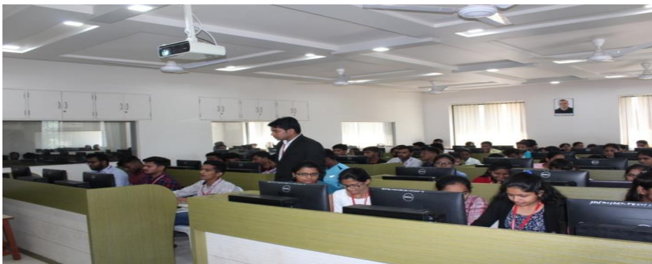
Practical Training for students