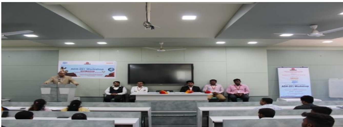
Introduction of Guest