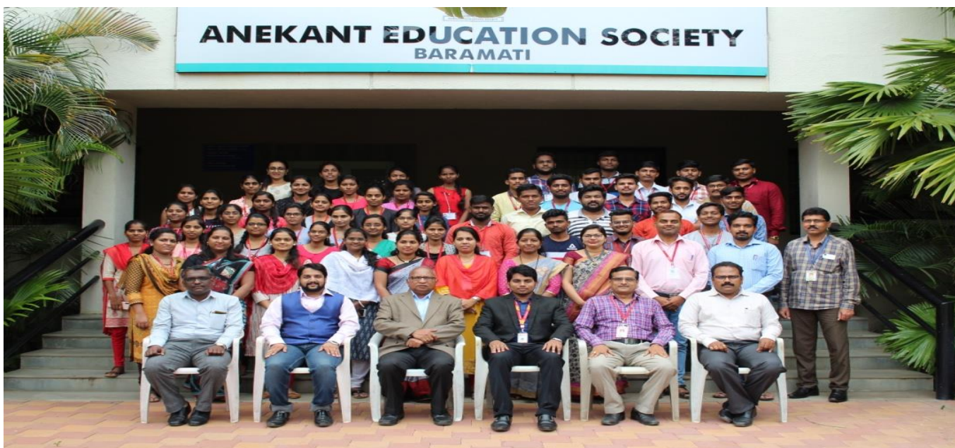
Overall participants for Workshop