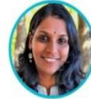
NEW MEDIA AND CULTURE