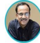
NEW MEDIA AND POLITICS

Department of Media and Communication Studies