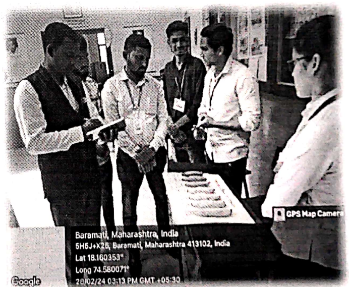
T.Y.B.Voc students explaining Module to Selection committee.