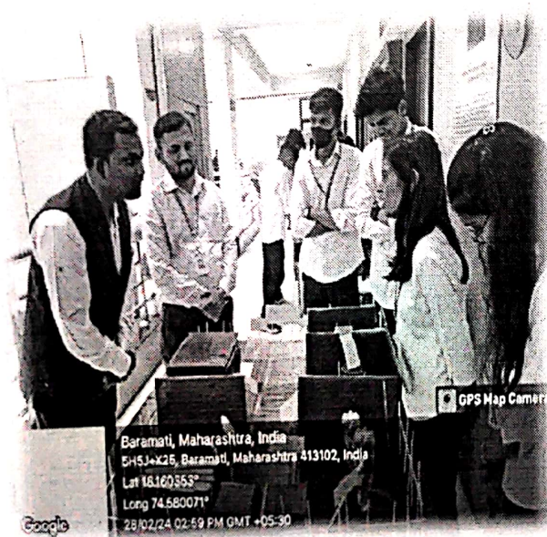
S.Y.B.Voc Students explaining Module to Selection committee.