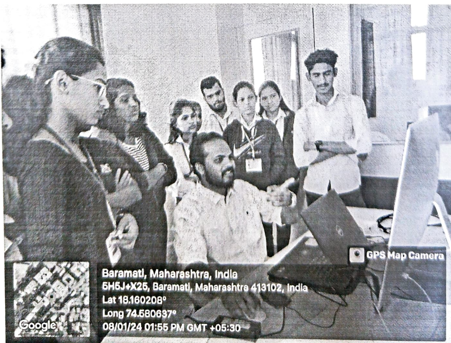
Students attending the class of Adobe Premiere Pro interface