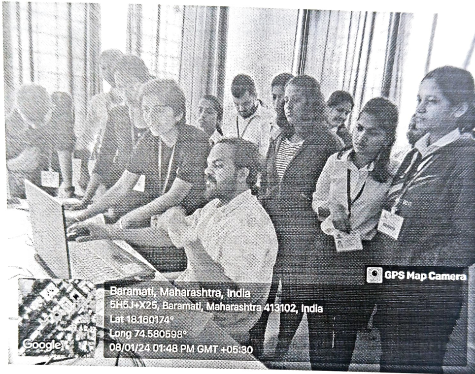
Students attending the workshop of Video Editing Software