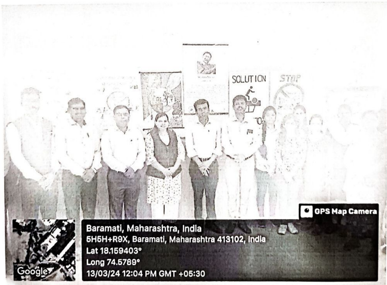
Faculty group photo with posters and students