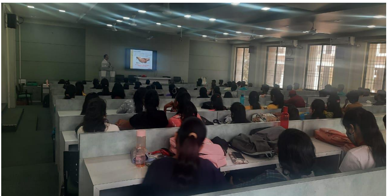
Students Attending the Workshop