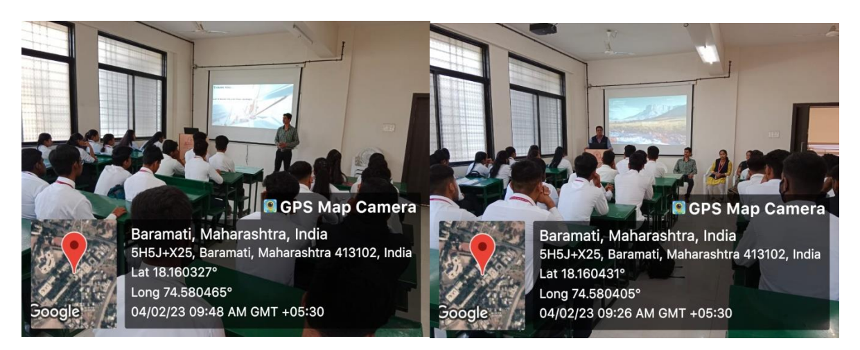
Guest Delivering Session to Students