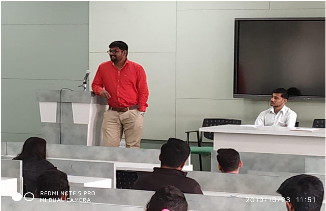
Interaction with students