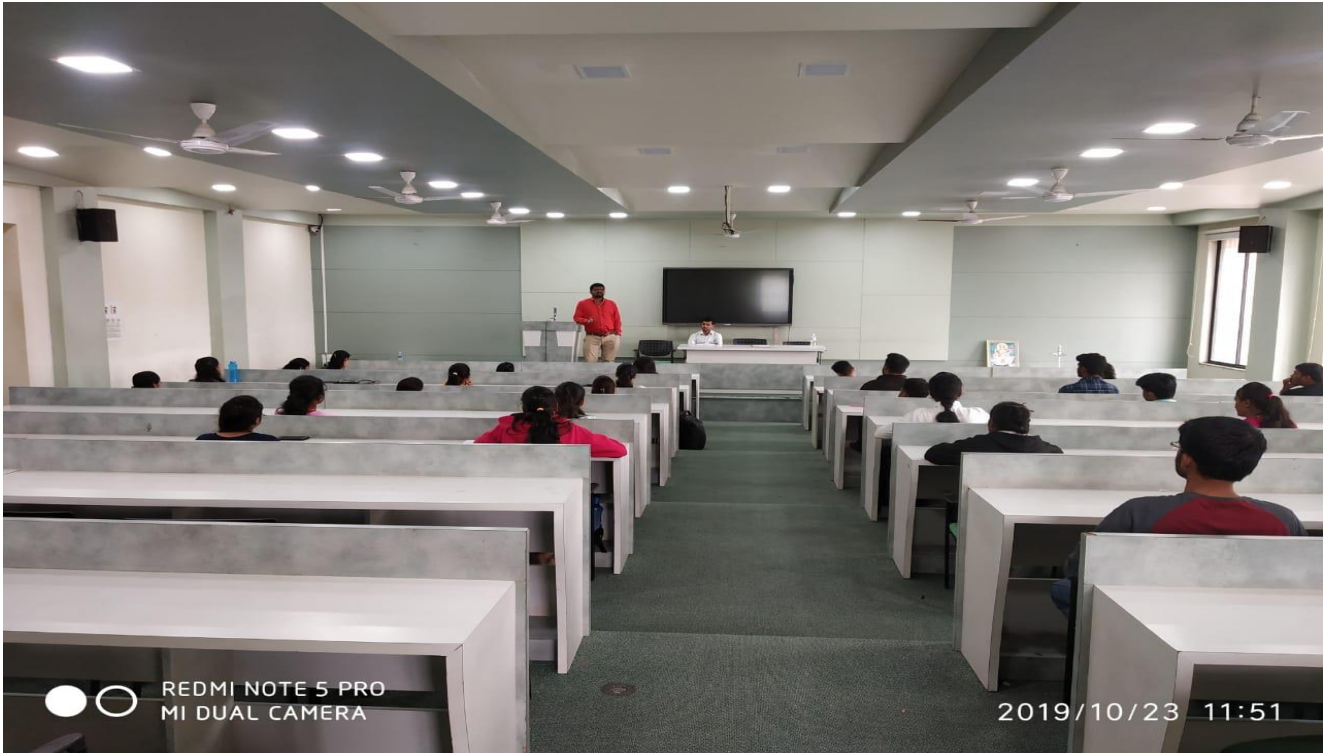
Interaction with students