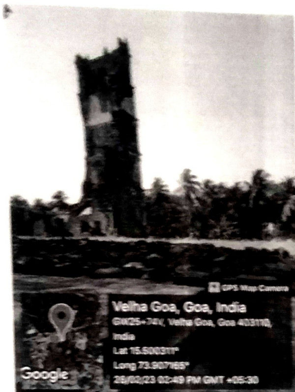
GPS Map Camera Veilha Goa, Goa, India GM25+74V, Veilha Goa, Goa 403110, India Lat 15.500311° Long 73.907165° 28/02/23 02:49 PM GMT +05:30 Google