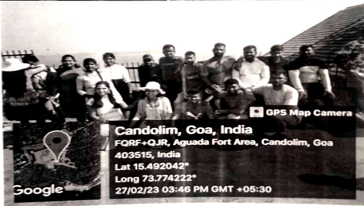
GPS Map Camera Candolim, Goa, India FQRF+QJR, Aguada Fort Area, Candolim, Goa 403515, India Lat 15.492042° Long 73.774222° 27/02/23 03:46 PM GMT +05:30 Google