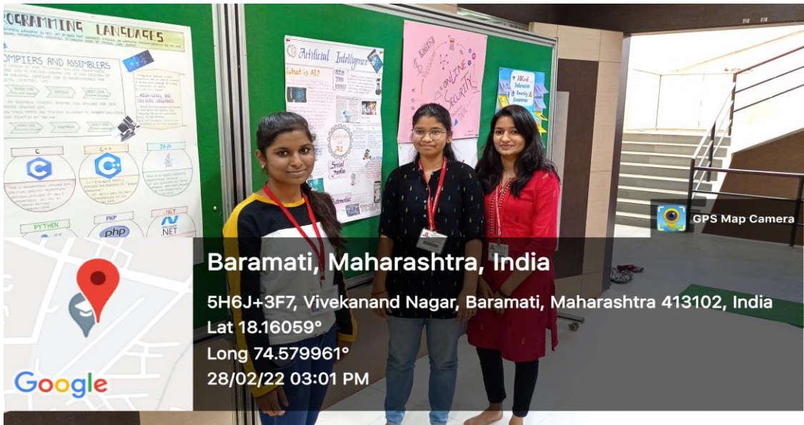
Poster presentation Competition