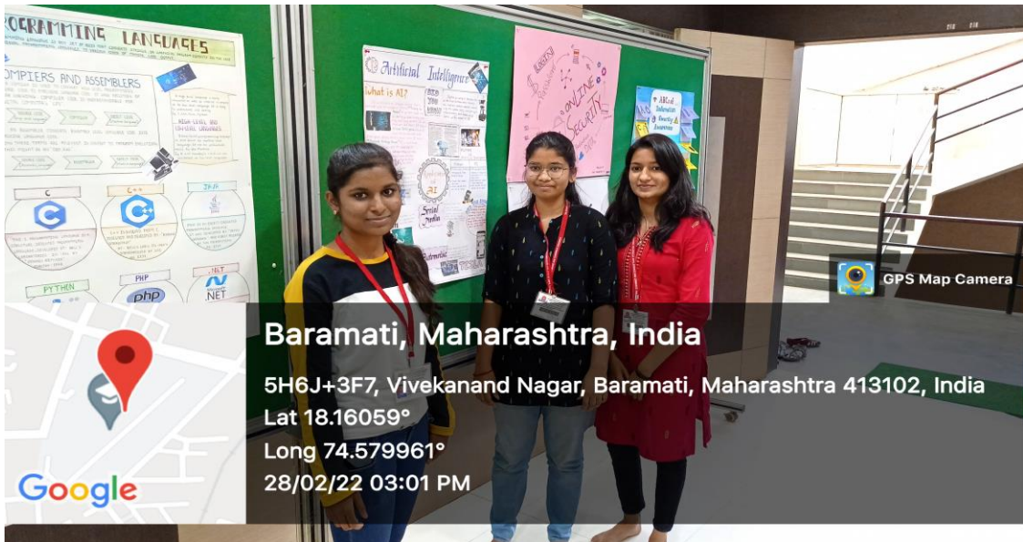
Poster presentation Competition