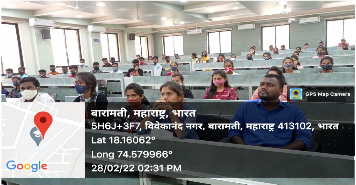
Participated students in smart talk competition