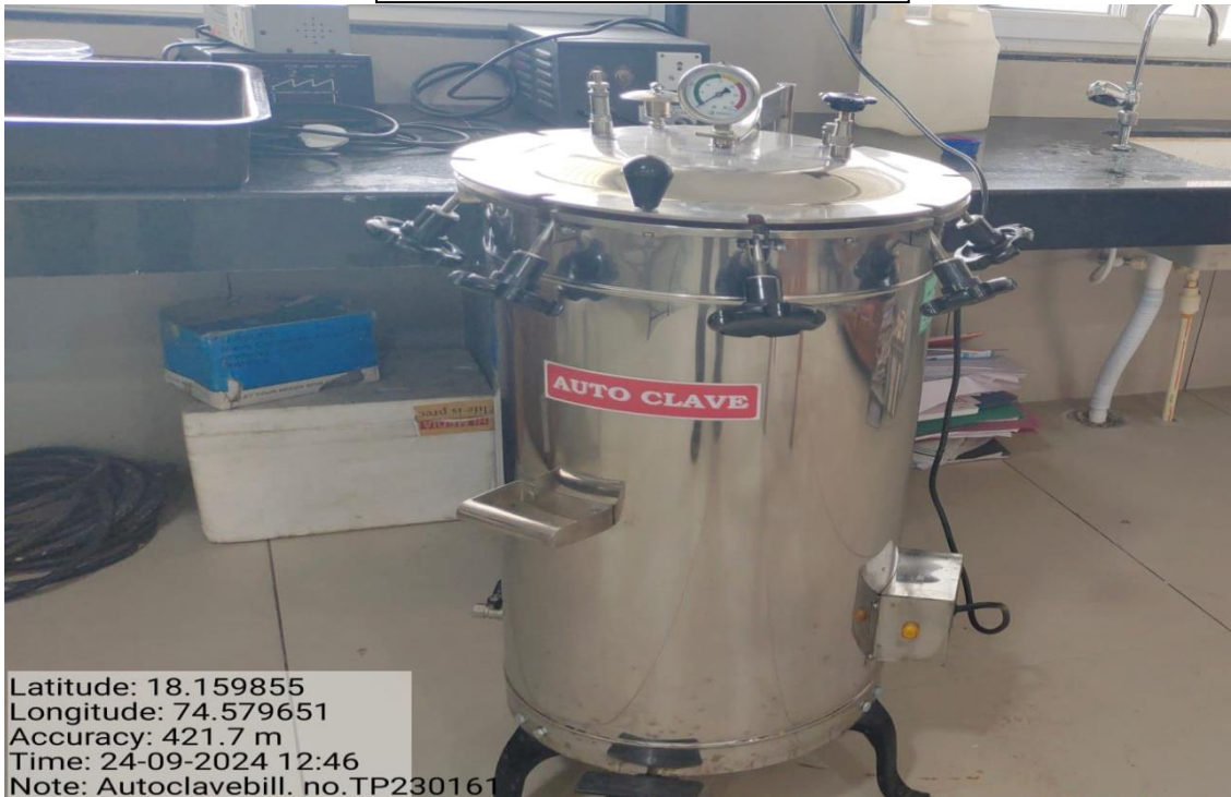
Autoclave (BTI-02 52 Lit) Purchased Under SR.NG

Latitude: 18.159855 Longitude: 74.579651 Accuracy: 421.7 m Time: 24-09-2024 12:46 Note: Autoclavebill. no.TP230161