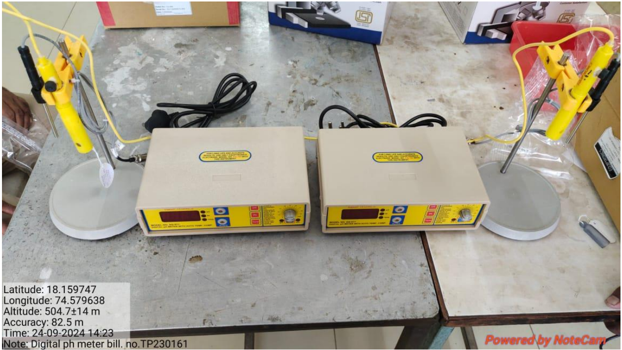
Ph Meter ( Equiptronics EQ-611) Purchased Under SR.NG

Latitude: 18.159747 Longitude: 74.579638 Altitude: 504.7±14 m Accuracy: 82.5 m Time: 24-09-2024 14:23 Note: Digital ph meter bill. no.TP230161