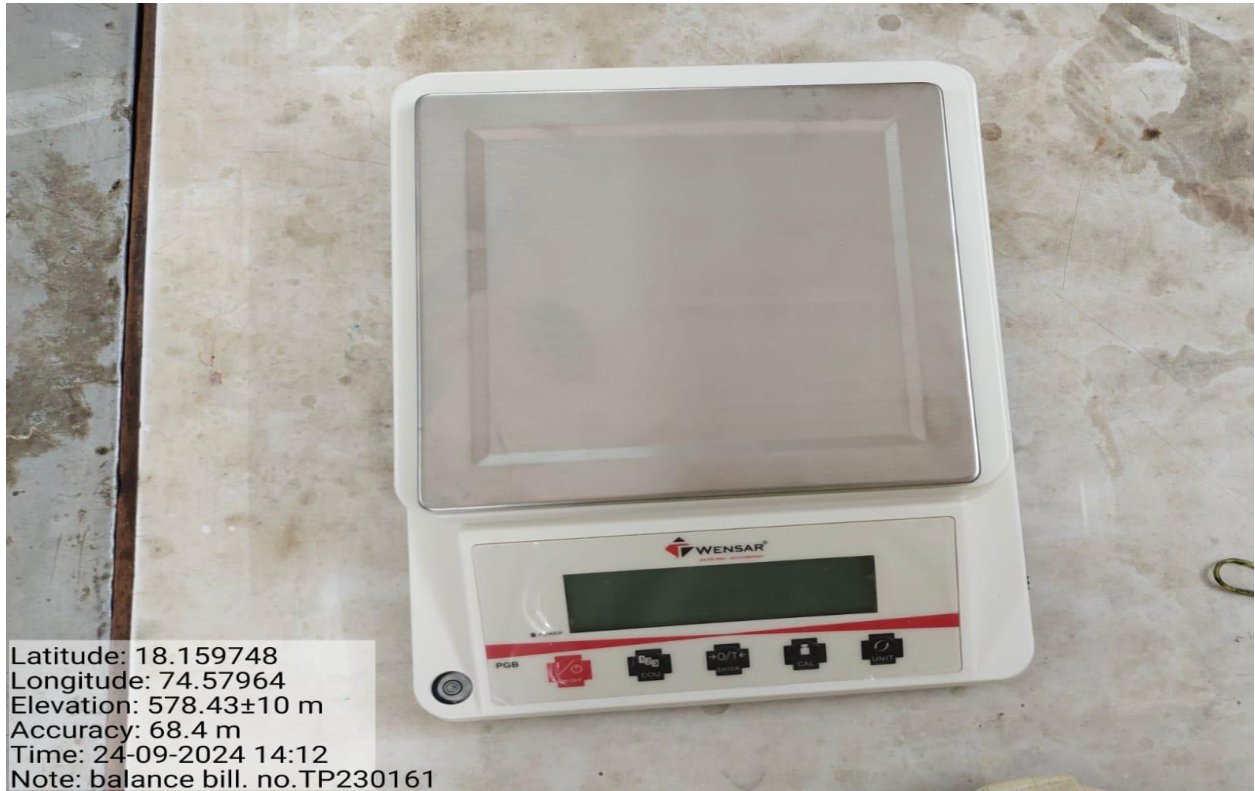
Balance ( Wensar PGB 6100.0.1gm - 6kg Purchased Under SR.NG

Latitude: 18.159748 Longitude: 74.57964 Elevation: 578.43±10 m Accuracy: 68.4 m Time: 24-09-2024 14:12 Note: balance bill. no.TP230161