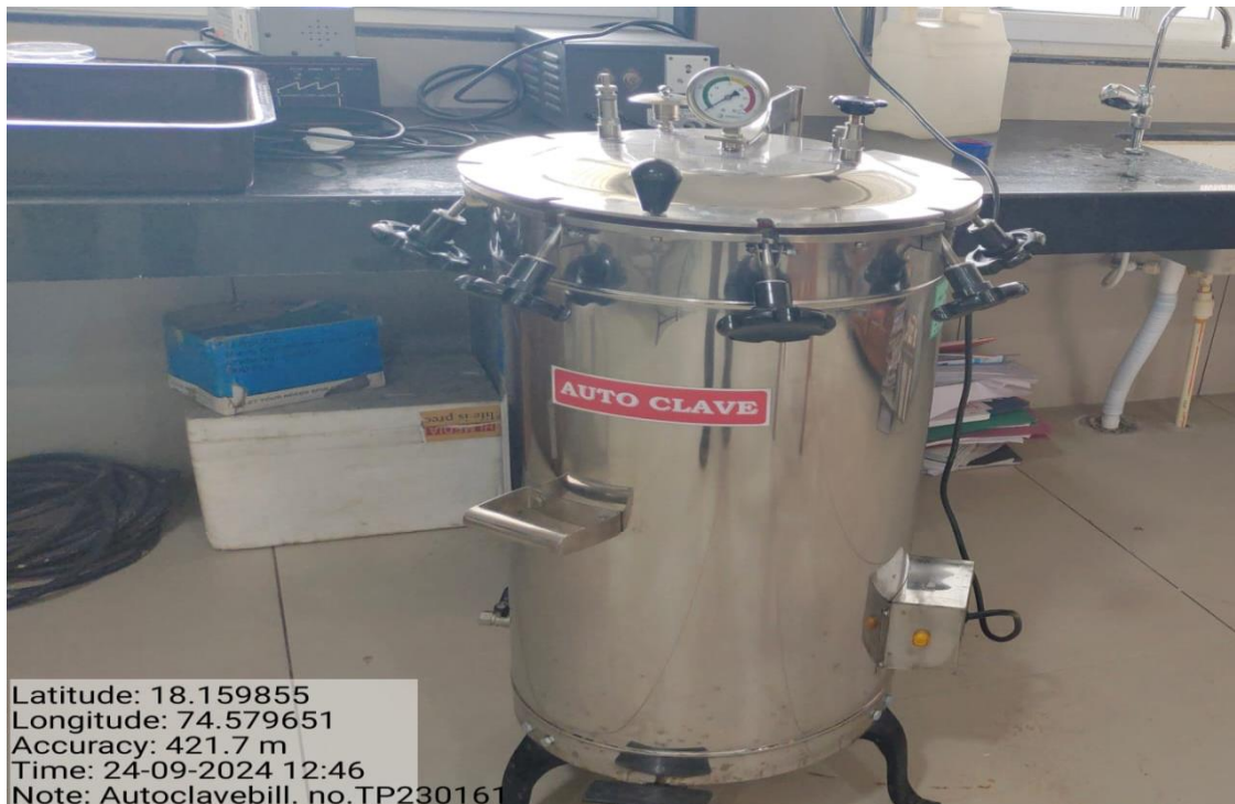
Autoclave (BTI-02 52 Lit) Purchased Under SR.NG

Latitude: 18.159855 Longitude: 74.579651 Accuracy: 421.7 m Time: 24-09-2024 12:46 Note: Autoclavebill. no.TP230161