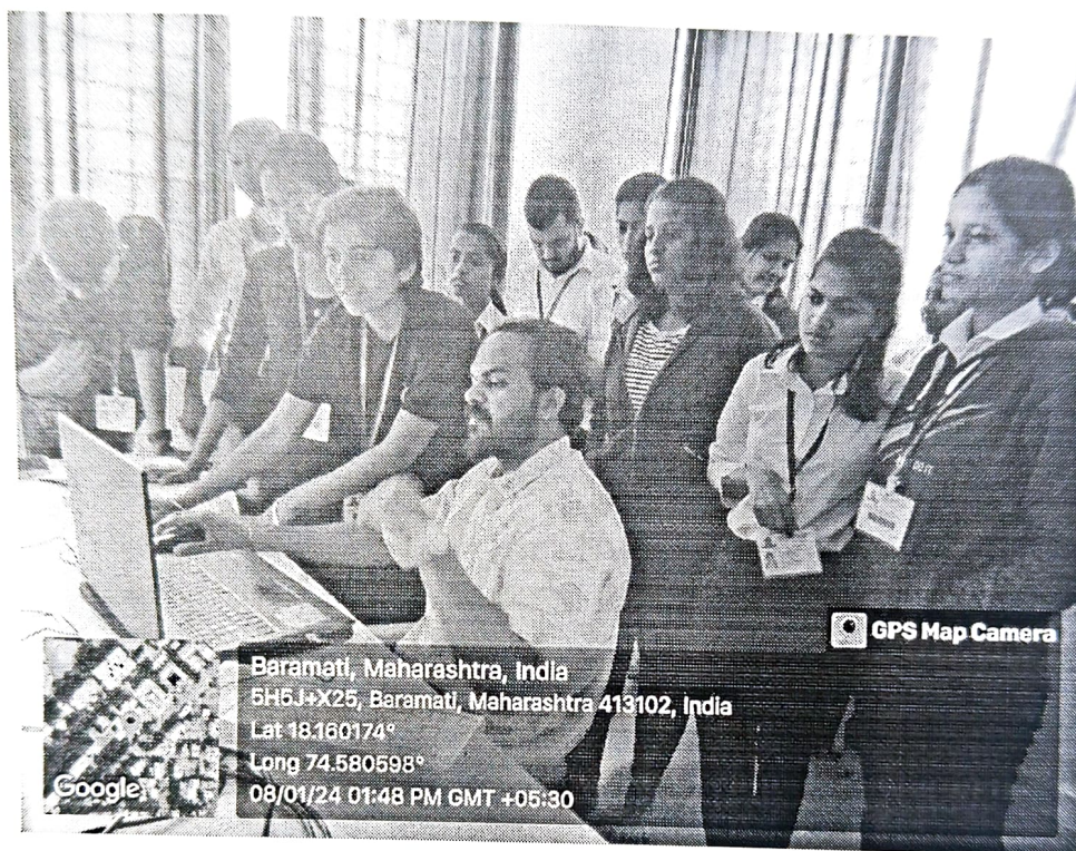
Students attending the workshop of Video Editing Software