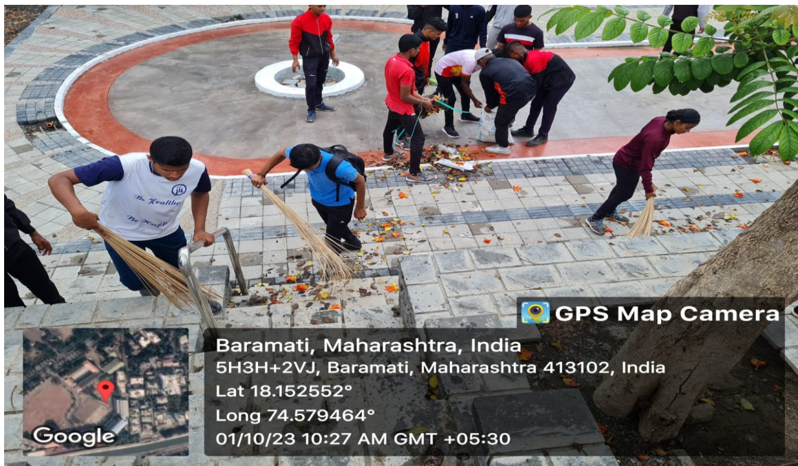
Students focusing on cleanliness and Community service