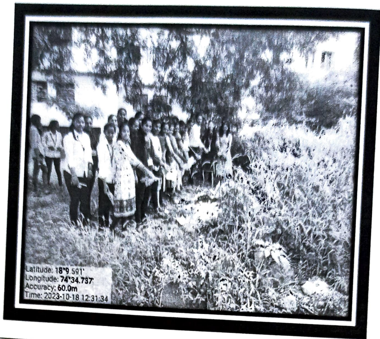
All the students gathered the garbage in one place.