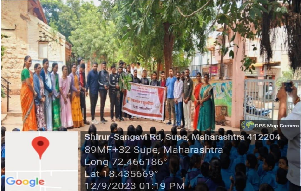
Street Play Activity with Primary School Teachers