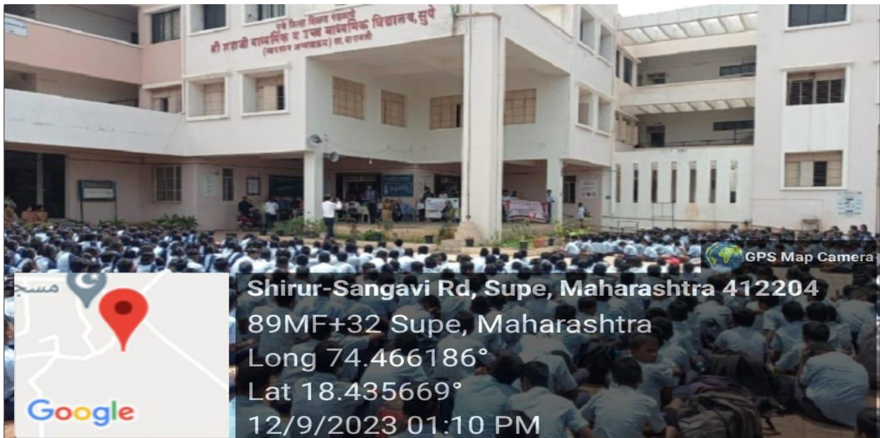
Delivered Lecture on Social Awareness by NSS Volunteers