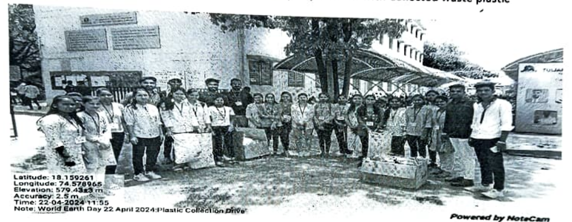
Students and Staff members of Botany Department with Collected waste plastic