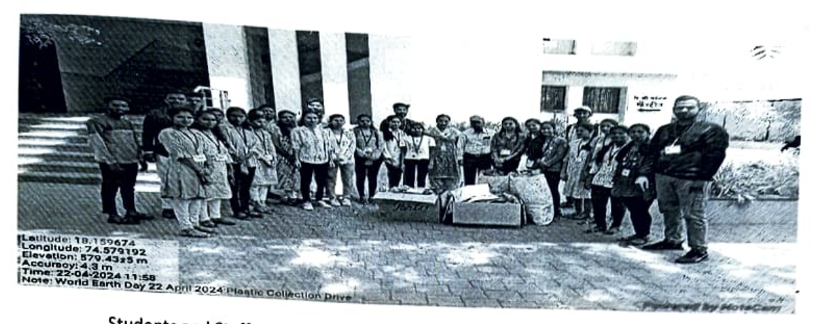
Students and Staff members of Botany Department with Collected waste plastic