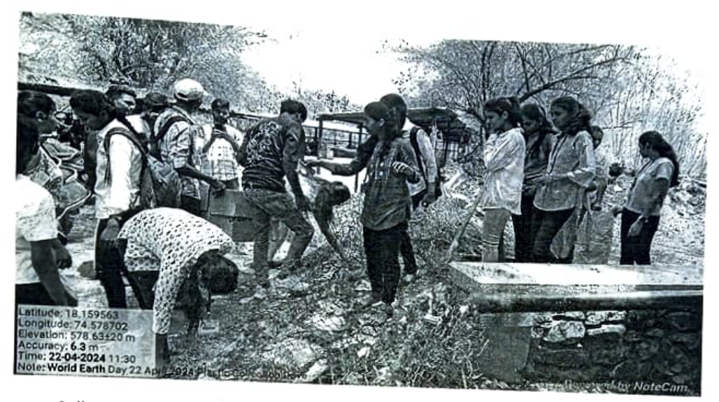
Collection of Plastic Waste in College campus area by our Students of Department of Botany

On the Occasion of WORLD EARTH DAY: 22 APRIL 2024 (Academic Year: 2023-24)