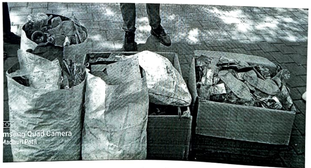
Collected Plastic Waste