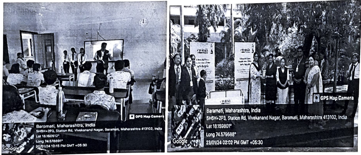
Students getting knowledge about disposal of E-waste