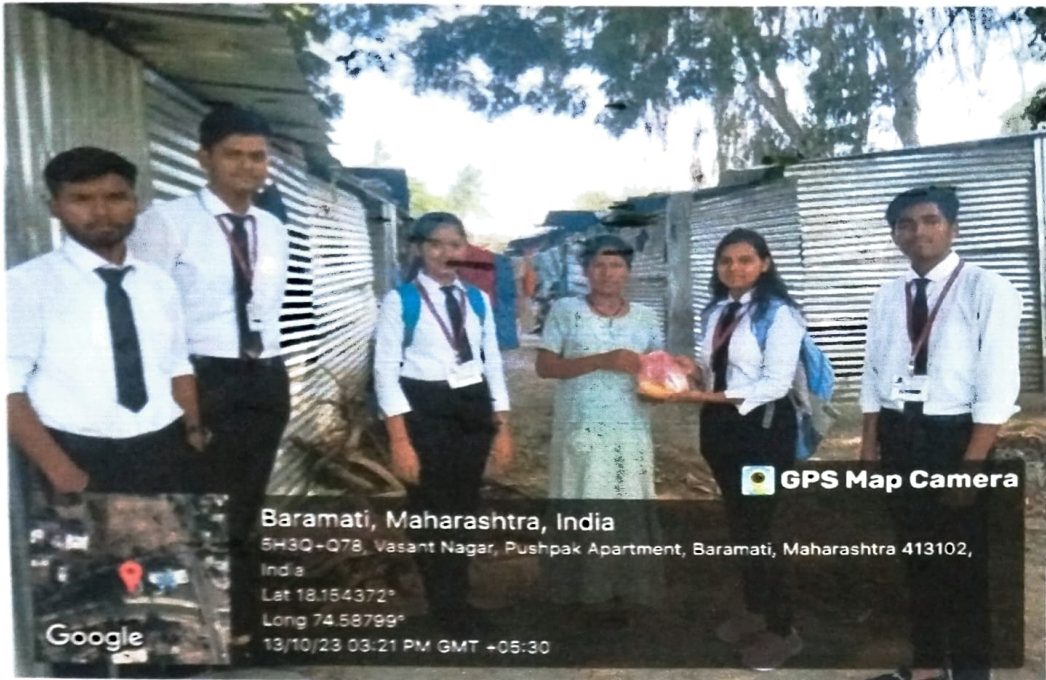
Supplying food to Labour