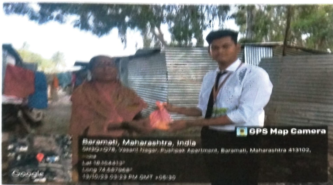
Supplying food to labour