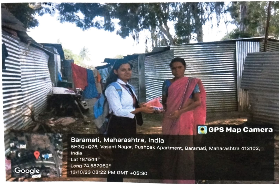
Supplying food to labour