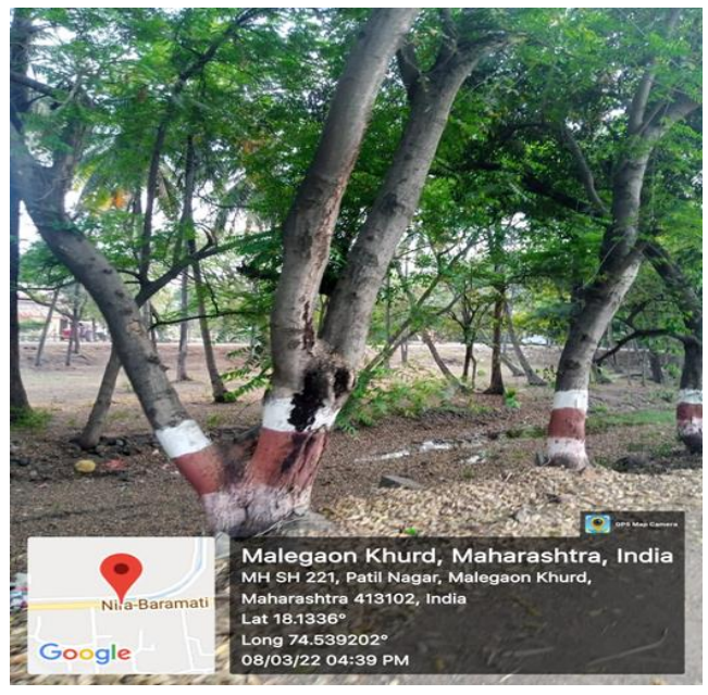
Tree information taken in details by NSS Volunteers