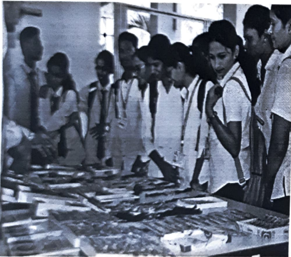
Selling to customers