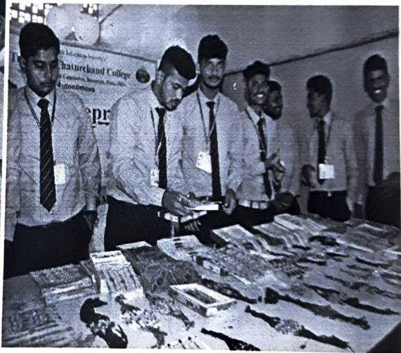
Selling to customers