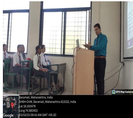
Guest Delivering Session to students