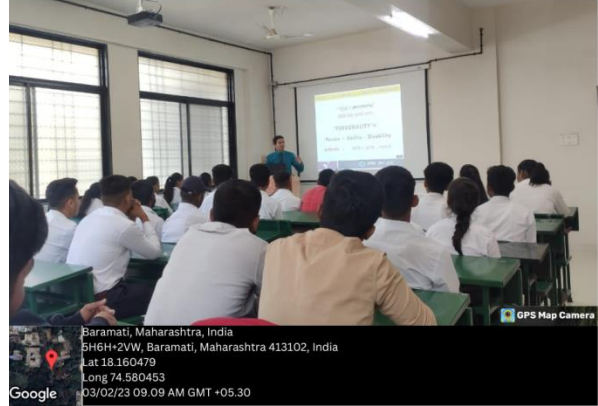
Guest Delivering Session to students