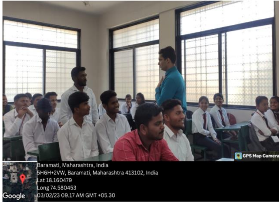
Discussion with students