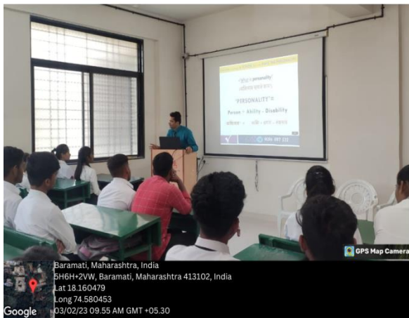
Guest Delivering Session to students