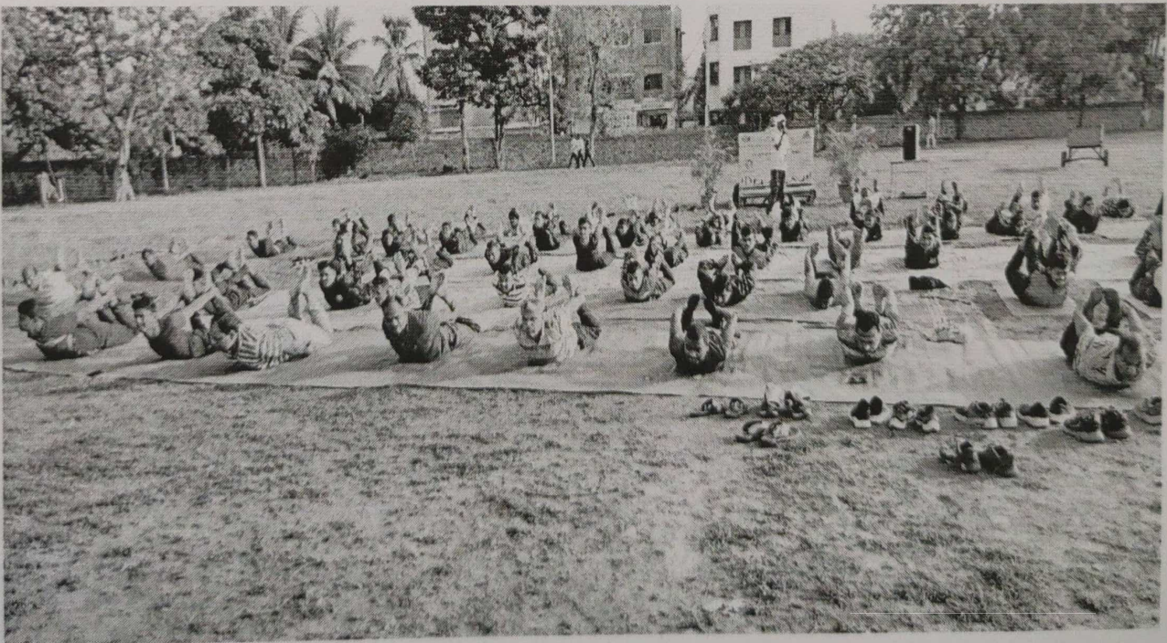
International Yoga Day Celebration June 2019 Practicing Asanas